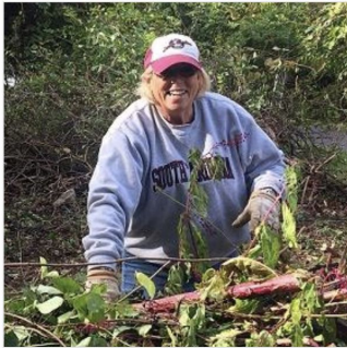
Community Service Week - Montgomery County Volunteer Center

Montage is very proud to support the Montgomery County Volunteer Center and Montgomery County Government.