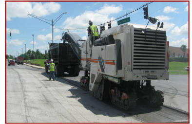
Milling machine excavating

Thank you for your cooperation as we make these improvements to the County infrastructure!