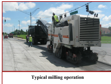
Typical milling operation

4. Pavement milling, edge and full width - Edge milling/grinding off the edges of the existing pavement near curbs and