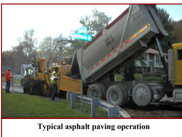
Typical asphalt paving operation

6. Crack Sealing - An additional step may be necessary to clean and seal large cracks that may not require full depth patching. A flexible filler material is injected into the cracks, filling voids and preventing water damage.