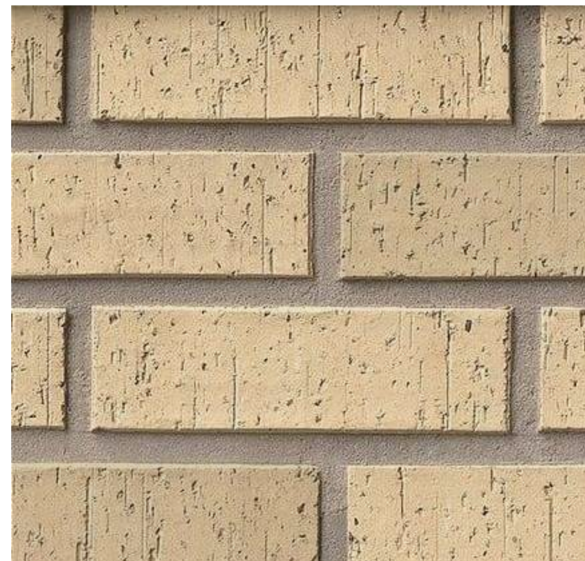
FBR-1 BUFF BRICK