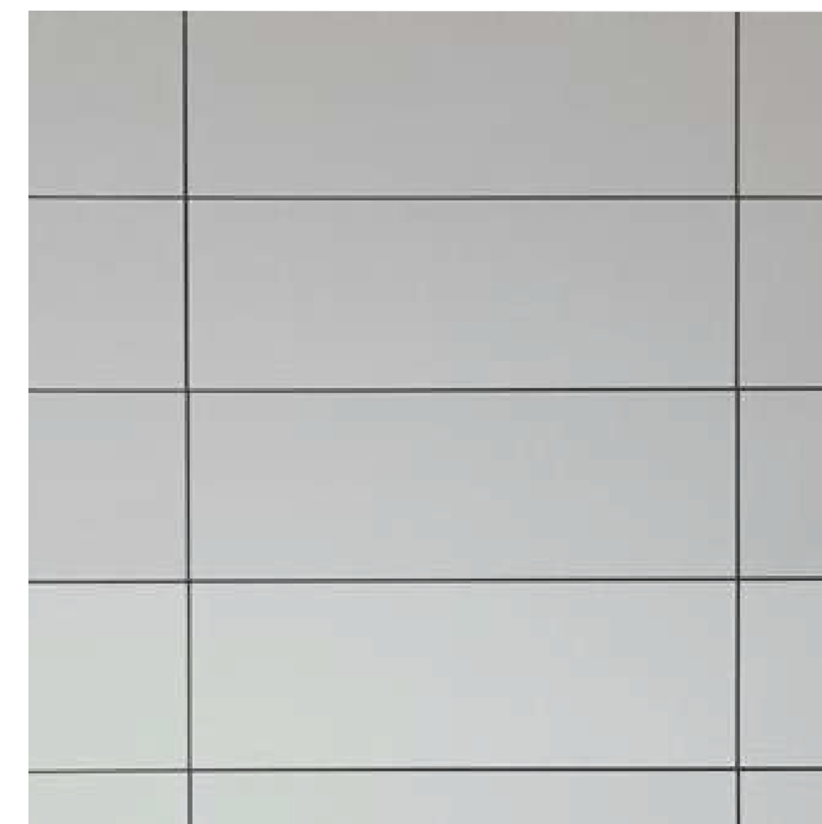
FSDG-3 CEMENT BOARD PANEL LIGHT GRAY STACK PATTERN