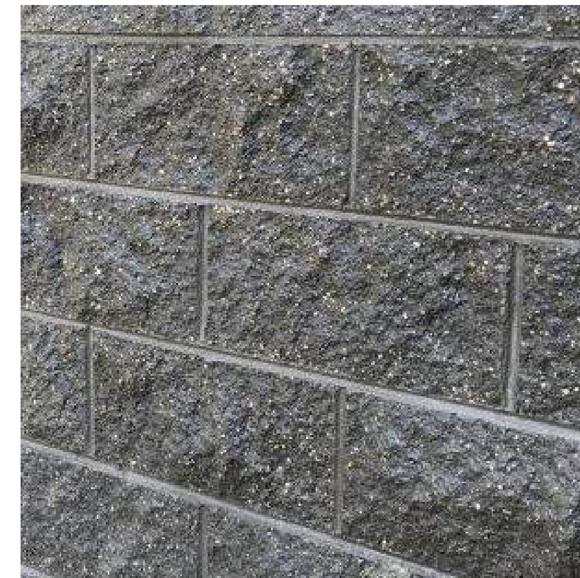
DCMU-1 DARK GRAY SPLIT FACE BLOCK