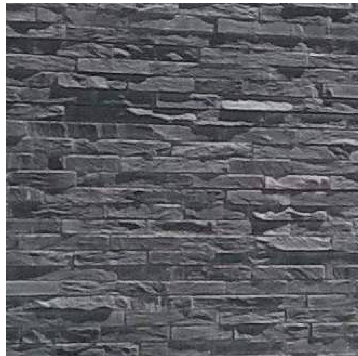
FBR-1 SLATE OR MANUFACTURED STONE