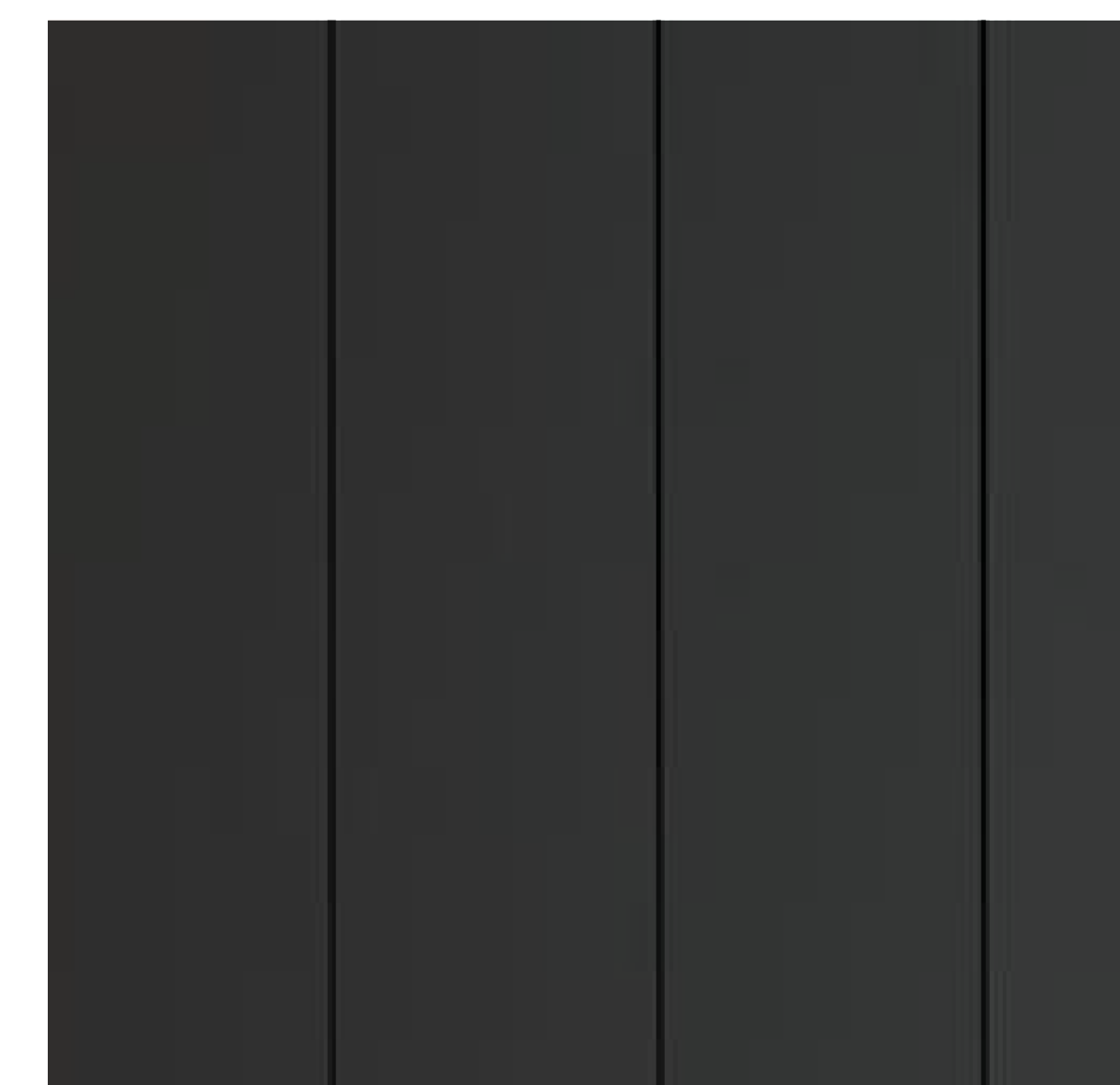
FSDG-4 CEMENT BOARD PANEL DARK GRAY VERTICAL BATTEN