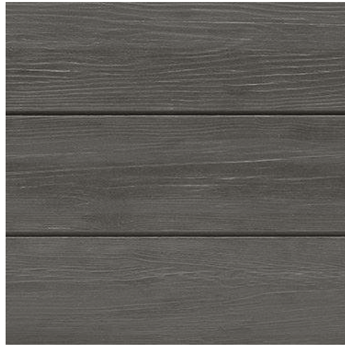
FSDG-1 CEMENT BOARD SIDING WEATHERED WOOD