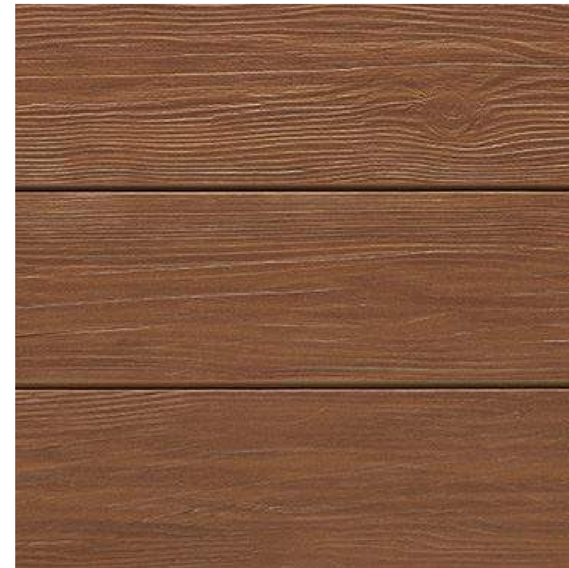
FSDG-2 CEMENT BOARD SIDING STAINED WOOD