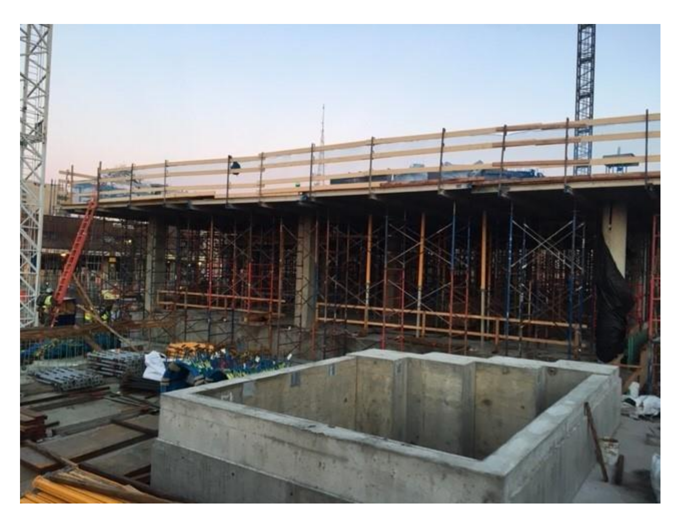
Building Level 1 (First Floor) - Completion on December 17, 2018