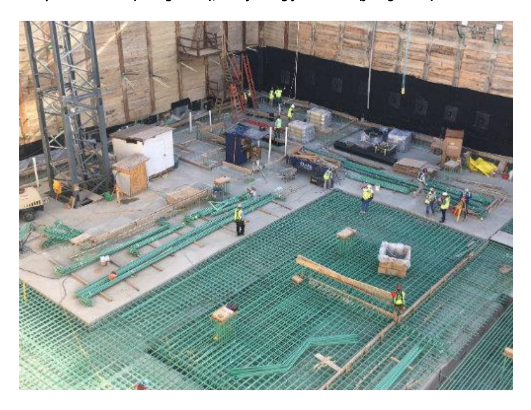
Reinforcing Mat for Pour#2