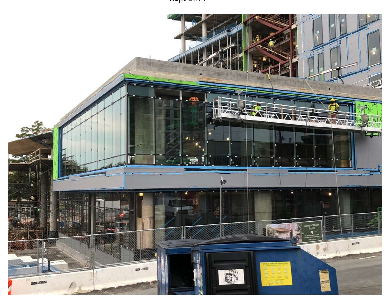
Main Lobby Glass Installation Sept 2019