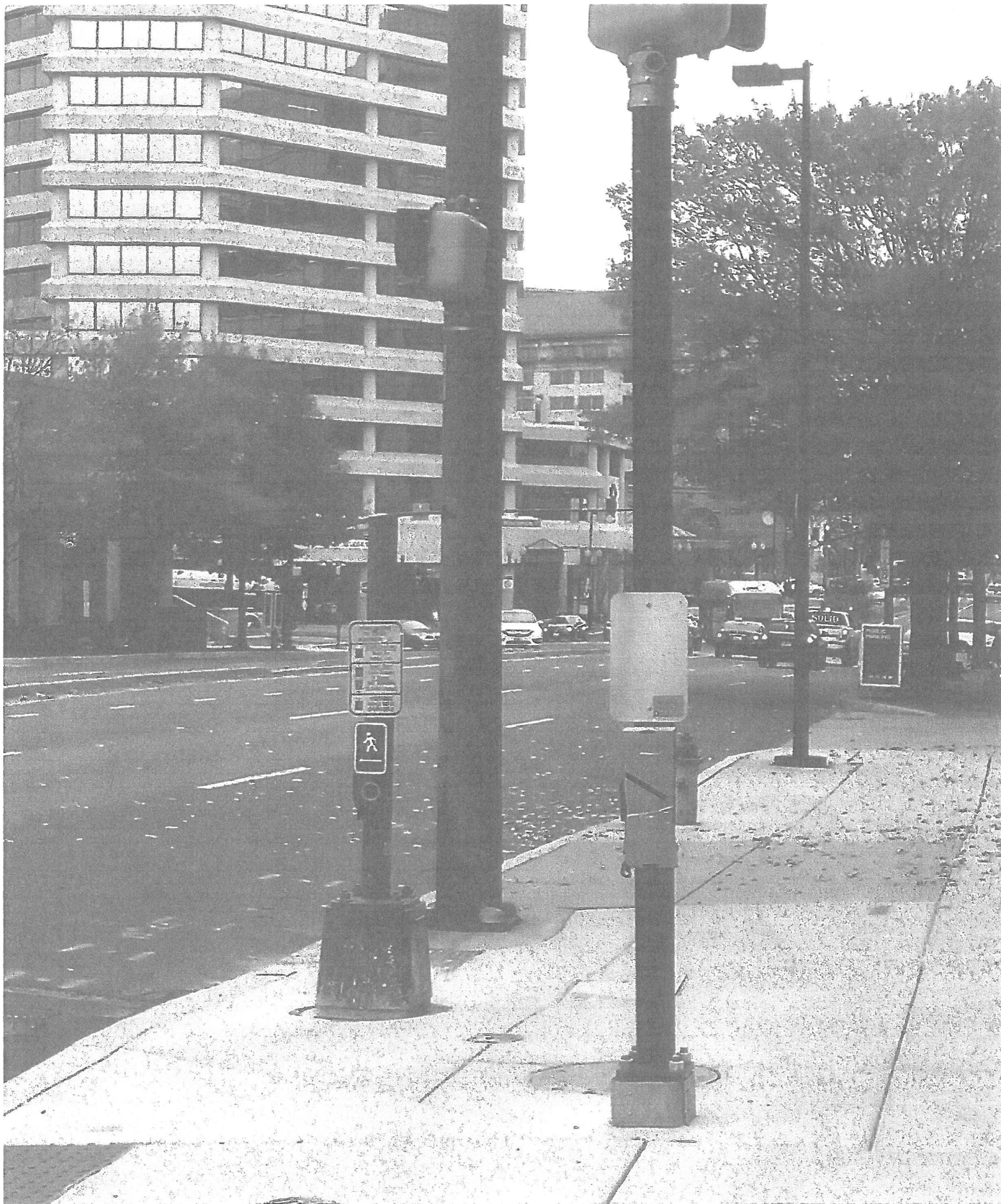
Mid Block STEP OFF PAD