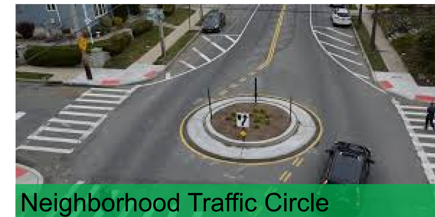
Neighborhood Traffic Circle