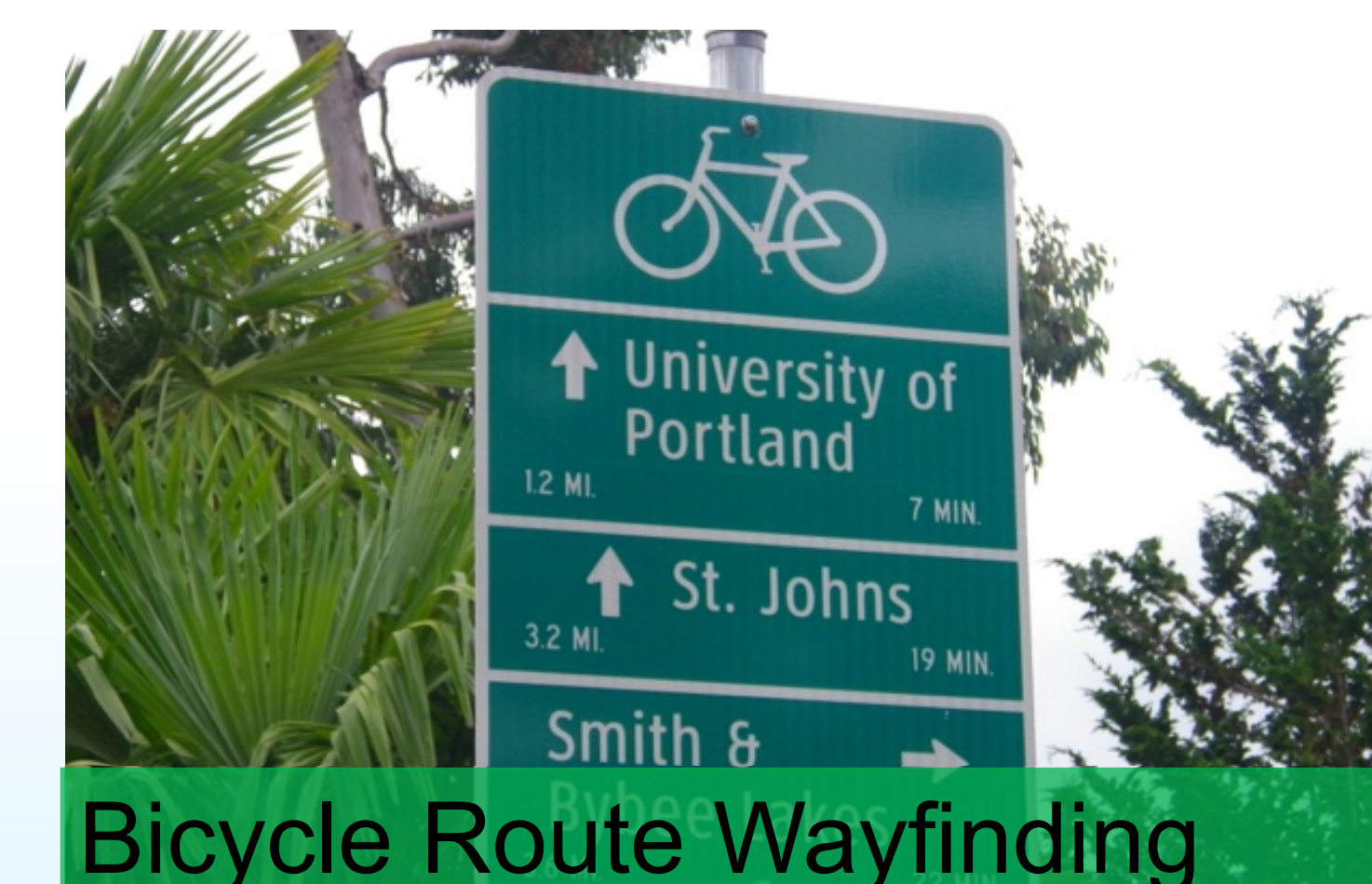
Bicycle Route Wayfinding