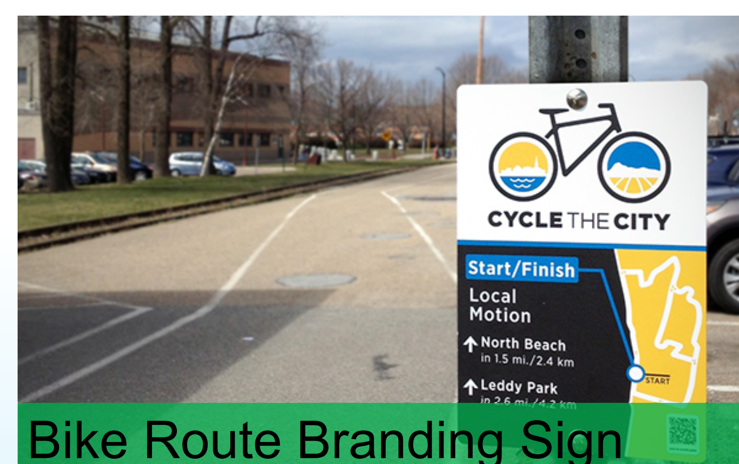
Bike Route Branding Sign

Clear route signage and pavement markings are provided throughout neighborhood greenways so bicyclists and pedestrians are aware of neighborhood destinations within biking and walking distance. Clear signage helps directs users to the safest route to their destinations.