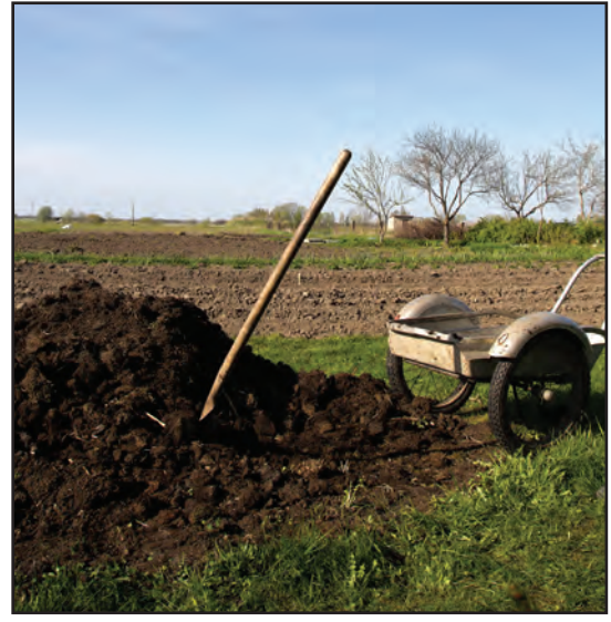
Training and education are key to on-farm composting success.