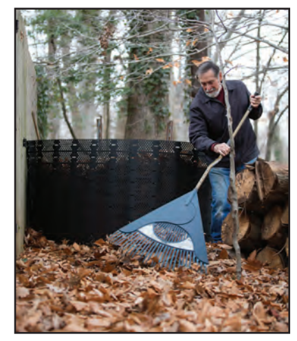
Successful backyard composting at the Aspen Hill home of a County resident.

In 1983, the County opened the Montgomery County Composting Facility, which initially composted leaves collected through the County's leaf vacuuming program. Between 1989 and 1994, the facility expanded its operations to include grass clippings. Since the early 1990's, DEP has provided weekly curbside recycling collection of yard trim materials from single-family households. Yard trim materials that are collected through the County's residential curbside recycling collection program, as well as those materials collected by private collectors, landscape contractors, and lawn care service providers from individuals, businesses, and multi-family properties, are first transported to the Montgomery County Shady Grove Processing Facility and Transfer Station in Derwood. Brush is ground and chipped into mulch at the Transfer Station and made available for residents to pick-up for their use. Grass and leaves are transported to the Montgomery County Composting Facility, where the material is composted. The end product, produced through the composting process, is a high-quality soil amendment, which is marketed and sold under the name Leafgro<sup>®</sup>.