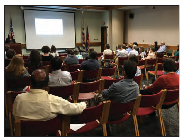
Stakeholders attend June 2017 meeting during which DEP describes details to develop the Strategic Plan to Advance Composting, Compost Use, and Food Scraps Diversion.

This Strategic Plan provides the direction, framework, and strategies to reduce wasted food, channel excess food to others to meet needs, increase recycling of food scraps through a variety of means, and encourage use of finished compost product. Pursuit of food scrap reduction and recycling efforts as described in the Strategic Plan will also reduce the amount of food scraps processed at County disposal facilities and preserve limited disposal capacity. This Strategic Plan includes a background, assessment of current efforts, and challenges associated with maximizing participation in six specific focus areas: reducing wasted food and channeling food to