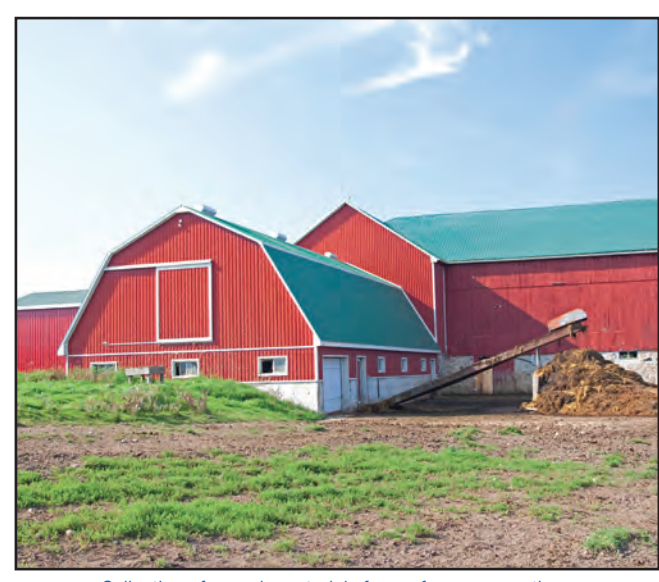
Collection of organic materials for on-farm composting.

The definition of "farm" as it relates to Maryland's Composting Facility Permit Regulations, means "the site of a business or activity operated for the primary purpose of tilling, cropping, keeping, pasturing, or producing an agricultural product other than compost, including livestock, poultry, plants, trees, sod, food, feed, or fiber, by in-ground, out-of-ground, container, or other culture." According to the United States Department of Agriculture's 2012 AgCensus Report<sup>10</sup>, it is