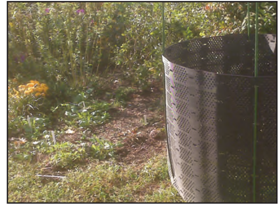
Backyard composting using the bin that DEP provides to interested residents.

The commercial sector, therefore, provides the greatest opportunity to divert these materials from the waste stream and recycle them instead, contributing to increases in the County's recycling achievement.