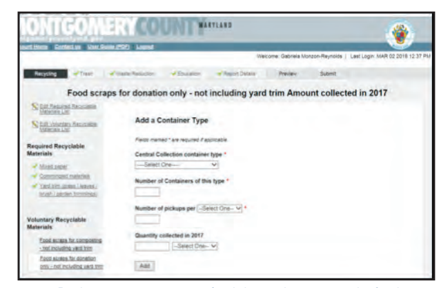
Businesses can report on food donated to community food donation programs through the DEP Annual Business Waste Reduction and Recycling Report.

Several businesses and organizations in Montgomery County actively maintain efforts to donate quality food to community programs that feed those facing food insecurity. In fact, some businesses have formal policies or guidelines in place that govern their food donation practices. According to information and data provided to DEP by businesses via their Annual Business Recycling and Waste Reduction Report, four businesses and one multi-family senior living community reported information pertaining to their food donation programs in Calendar Year 2015. While it is likely that there are many other food donation programs in place, these four businesses and one multi-family property voluntarily reported donating an estimated 149 tons of consumable food to organizations that feed those in need. The food was either distributed to local programs or consolidated with food from other stores in the region and distributed as part of nationwide distribution efforts.