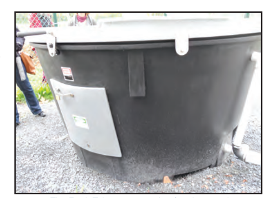
The Earth Tub, one example of an in-vessel or closed vessel composting system.

In-vessel compost systems are equipped with a rotating drum or other equipment to control the flow of incoming materials and ensure the size of the materials are more uniform in nature. A variety of processing screens and other devices are used to remove contaminants and prepare a marketable product. These systems are typically equipped with an air collection system and biofilters to remove odor from exhausted air. Curing of the composted material is necessary after the initial