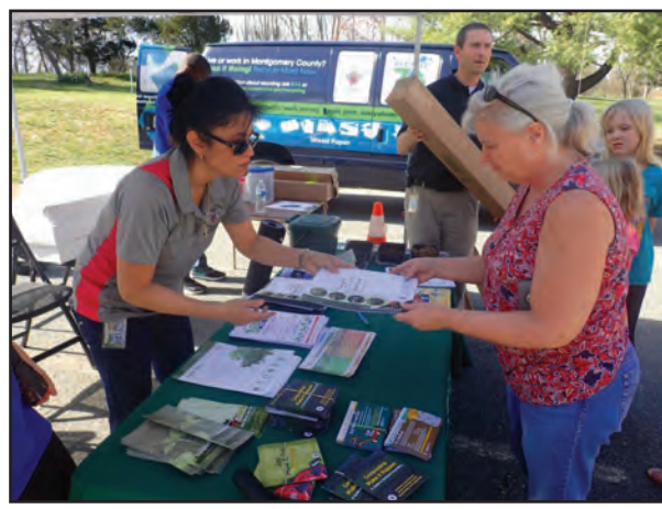
DEP compost bin distribution and grasscycling and composting educational event.