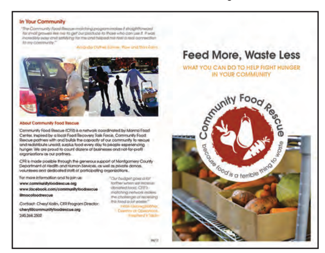
Community Food Rescue brochure.

A summary report of the Food Recovery Summit written by MDE<sup>7</sup> included a list of challenges and possible solutions to increasing food recovery (either through increasing infrastructure for food scraps composting programs or through promoting source reduction and donation of food to those in need), and some of these challenges and solutions have been incorporated into this Strategic Plan.