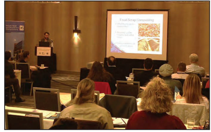
Presentation on food scrap composting given to attendees at DEP's Business Waste Reduction and Recycling Seminar.

The County has identified a few businesses that have implemented some form of on-site composting program, where organic materials generated on-site at the place of business are also managed and composted on-site at that property. There are many more businesses and institutions that have implemented food scrap recycling collection service where food scraps generated on-site are separated at the point of generation, collected by a food scraps recycling collection company and transported off-site to commercial composting facilities for processing.