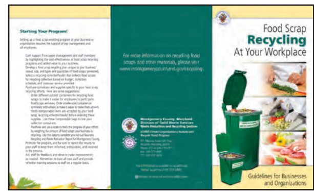
DEP food scrap recycling brochure for businesses and institutions.

Since the 1990's, DEP has provided tailored and individualized assistance to numerous businesses, including grocery stores, restaurants, and others that generate significant amounts of food scraps to set up food scrap recycling programs. Through these programs, businesses have separated their food scraps from other waste and recyclable materials, and have contracted with collectors, or have self-hauled, food scraps to composting facilities for recycling.