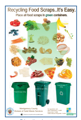
Educational poster on food scraps recycling.