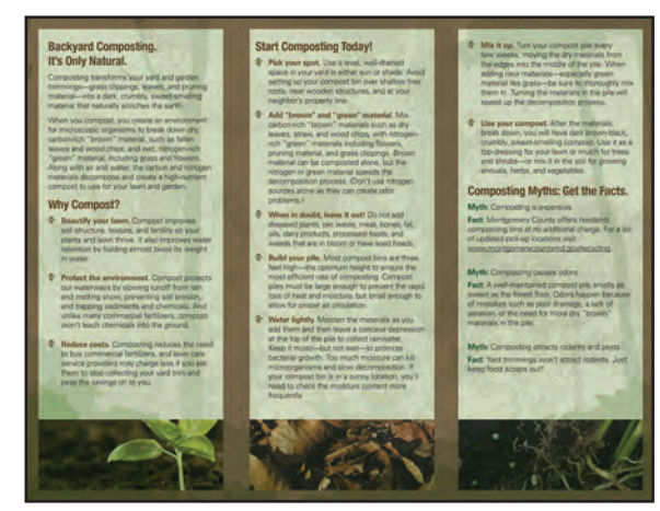
Brochure on backyard composting distributed by DEP.

To date, the County has not undertaken initiatives to expand communityscale yard trim composting programs to include food scraps or other organic material, such as soiled paper or compostable food service products.