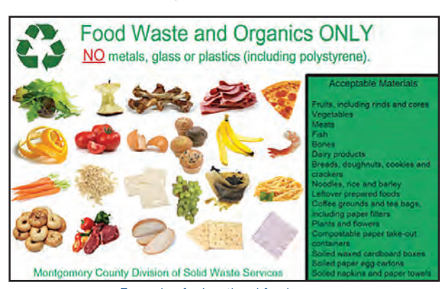
Example of educational food scraps recycling container label developed by DEP.

It is estimated that 51,000 tons of food scraps are disposed in the trash by the single-family sector annually. Diverting food scraps and other acceptable organic materials for recycling from the single-family sector would help the County towards achievement of the County's goal to reduce waste and recycle 70% by 2020. To increase recycling of food scraps generated by single-family residents, the County should consider a curbside food scraps recycling collection pilot.