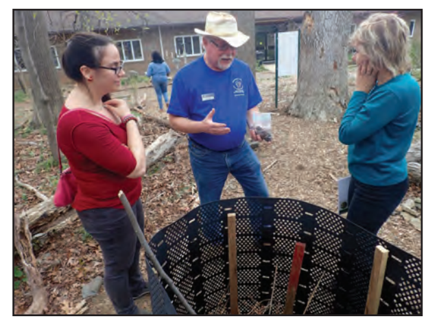
Training led by DEP Recycling Volunteer Master Composter on backyard composting.

Continue to track and monitor the distribution of compost bins provided to residents, as well as to community groups.