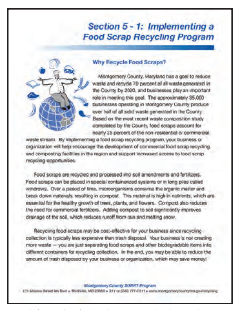
Information for businesses on implementing food scrap recycling programs provided in Business Recycling Handbook.

Availability of Feedstocks and Sizing of Programs. Assessing the amount of food scraps generated on-site by businesses and institutions to determine the type and size/capacity of on-site composting operations is critical.