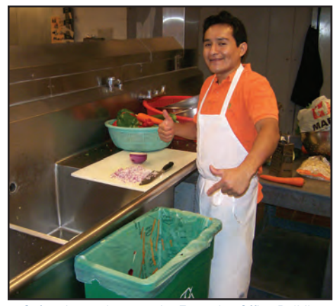
Cafeteria employee at the Executive Office Building in Rockville separates pre-consumer food scraps for recycling collection.

Food Scraps Recycling Collection in County Buildings. To develop best practices and gain first-hand expertise, DEP developed and implemented a model food scrap recycling collection program for pre-consumer food scraps in the cafeterias at three County government buildings: the Executive Office Building and the Council Office Building in Rockville, and the Public Safety Headquarters Building in Gaithersburg. Pre-consumer food scraps are separated from the waste stream by cafeteria employees. The food scraps are placed in collection containers during food prep for breakfast, lunch and any catering events. Towards the end of day, any leftover prepared food is placed in carryout containers and sold at a discounted rate; remaining food is then placed into the central food scrap recycling collection containers. The food scraps are collected by a private recycling collection company and are transported to the Prince George's County Composting Facility in Upper Marlboro, Maryland for composting. Through these demonstration projects, DEP has developed educational materials and best practices on implementing food scrap recycling programs, which have been used to provide technical