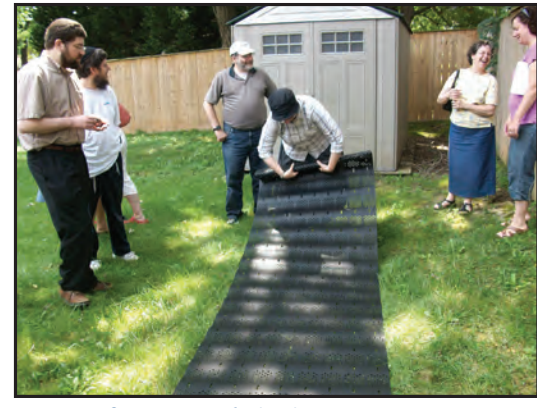
Congregants of a local synagogue set up a compost bin on their property.

In late 2001 and early 2002, DEP met with the Montgomery County Department of Correction and Rehabilitation (DOCR) to research the feasibility of an in-vessel composting system to process food scraps on-site at the Montgomery County Correctional Facility (MCCF) in Boyds. At the time, Art