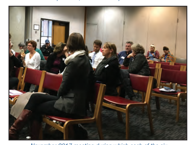
November 2017 meeting during which each of the six Working Groups share information on their efforts to support development of the Strategic Plan.

others; in-home, backyard and community-scale composting; on-site institutional and on-site business composting; on-farm composting; composting capacity to serve Montgomery County; and strategies to maximize collection of food scraps at the curb. In addition, the Strategic Plan includes recommendations in each focus area to address policy, legislation, regulations, education, metrics, and resources.