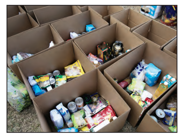
Food collected for donation.

Reducing the amount of food disposed of has many benefits. Not generating excess food scraps in the first place reduces the amount of waste that needs to be managed, potentially resulting in reduced costs in terms of collecting food scraps for composting or disposal. Food scraps generated in excess of generators' needs but that are consumable (i.e., prepared foods, baked goods, fresh produce, canned or boxed foods, etc.) can be diverted from the solid waste stream and, more desirably, provided to residents who are in need of nutritious food that they otherwise may not be able to access. This channeling of food to others with unmet needs ensures that the highest and best use of this food occurs. Diverting food from the County's waste disposal stream reduces the amount of waste that must be processed at County solid waste processing facilities, reducing the capacity needed for solid waste processing infrastructure to dispose of the material.