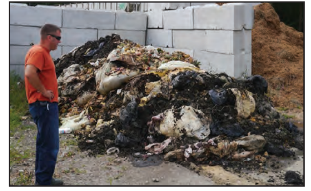
Example of contamination in a load of food scraps.