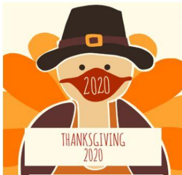
(Seasonal art: CDC)

The District of Columbia launched on Nov. 23 a neighborhood-specific, online retail directory to promote local small-business shopping, “safely from your home” – https://shopinthedistrict.com/