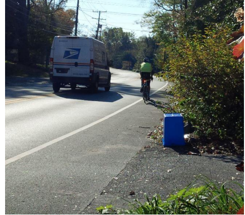
MD-191 Corridor within scope of CIP #P501733, Bethesda, MD