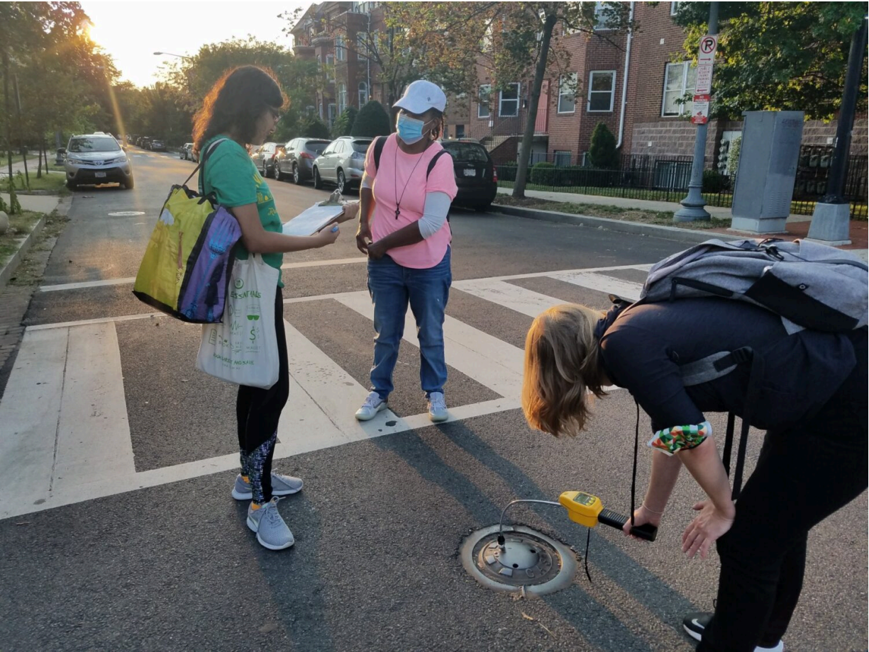
Volunteers testing for gas leaks.

Natural gas is mostly methane, a potent greenhouse gas with 80 times more warming power than carbon dioxide, when measured over 20 years. Burning natural gas on your stove or furnace releases greenhouse gas emissions, but natural gas can also contribute to climate change by leaking directly from pipes on the way to your home — or even from appliances within your home .