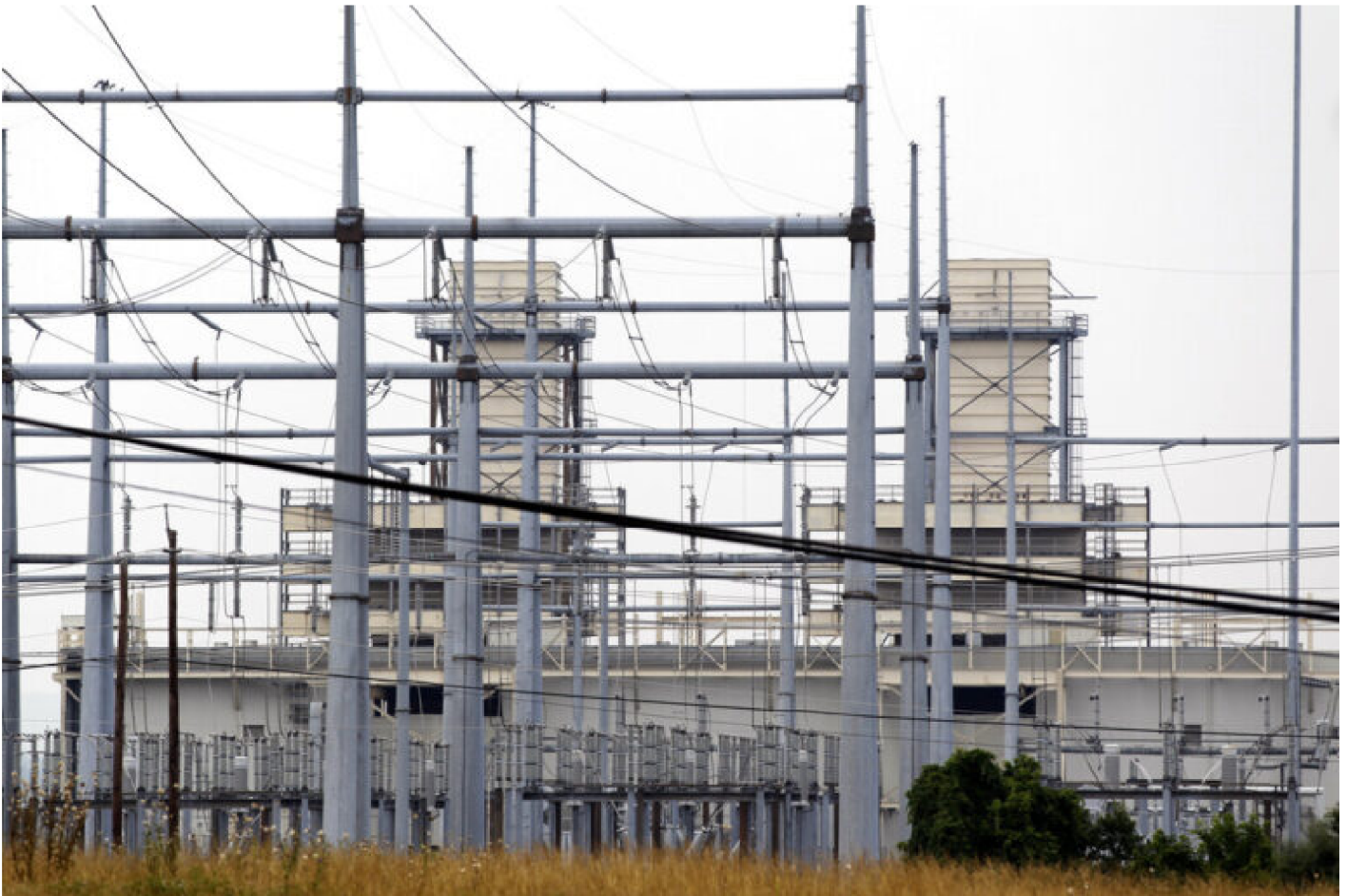
A power plant in Dickerson, Md.