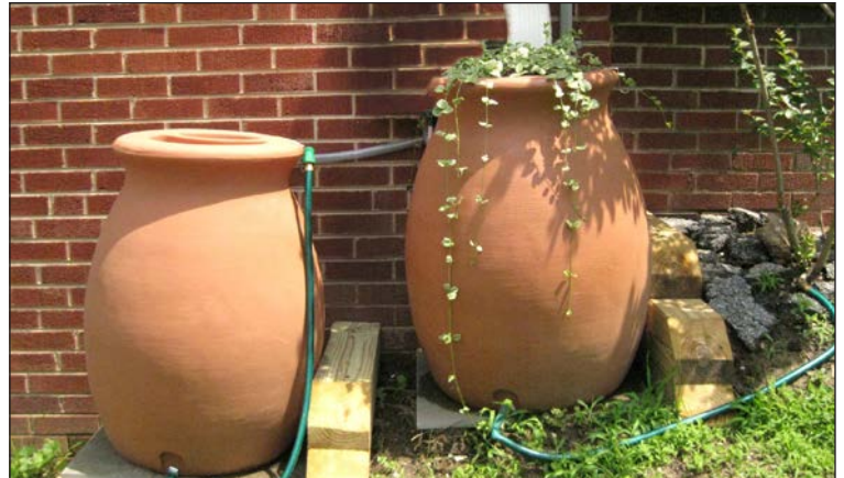
Rain barrels with “planter tops”

By maintaining your rain barrel, you are doing your part to conserve water and protect your local streams and the Chesapeake Bay.