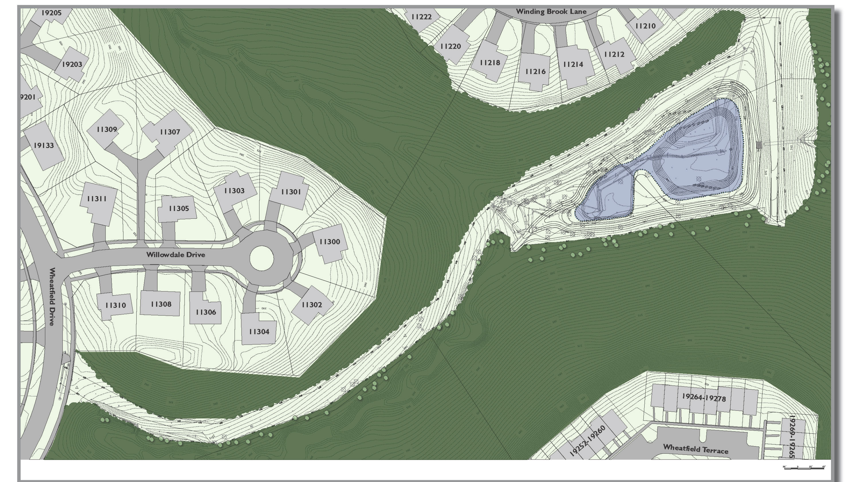
Construction Access Map