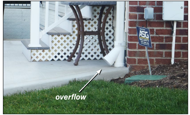
Dry well downspout overflow for large storms

No, you cannot remove any facilities that were part of your building installation. These are permitted structures and DEP maintains a database of these facility locations. DEP may perform a maintenance inspection of your practice if it is a permitted structure. Contact DEP to find out if you have a permitted structure or if you would like to discuss options for modifying your facility.