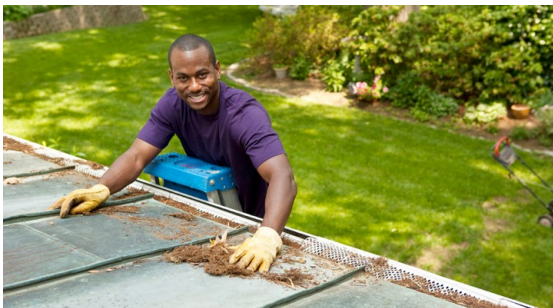
Clean gutters will help keep debris from clogging your dry well.

Remove leaves and tree debris from gutters and downspouts