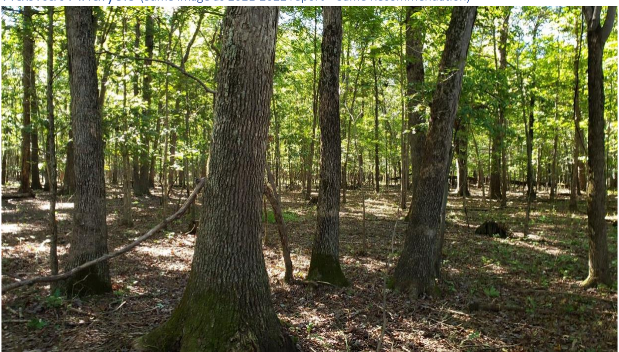
Figure 1- This image shows the lack of sunlight on the forest floor which results in very low, ground level food sources for other animals such as squirrels, rabbits, ground nesting birds, turkeys and more. This is a result of an earlier overpopulated deer herd and will not bounce back until the ground is disturbed (raking, mulching or fire) and sunlight is able to reach the forest floor.

Habitat Analysis (Same image as 2021-2022 report – Same Recommendation)