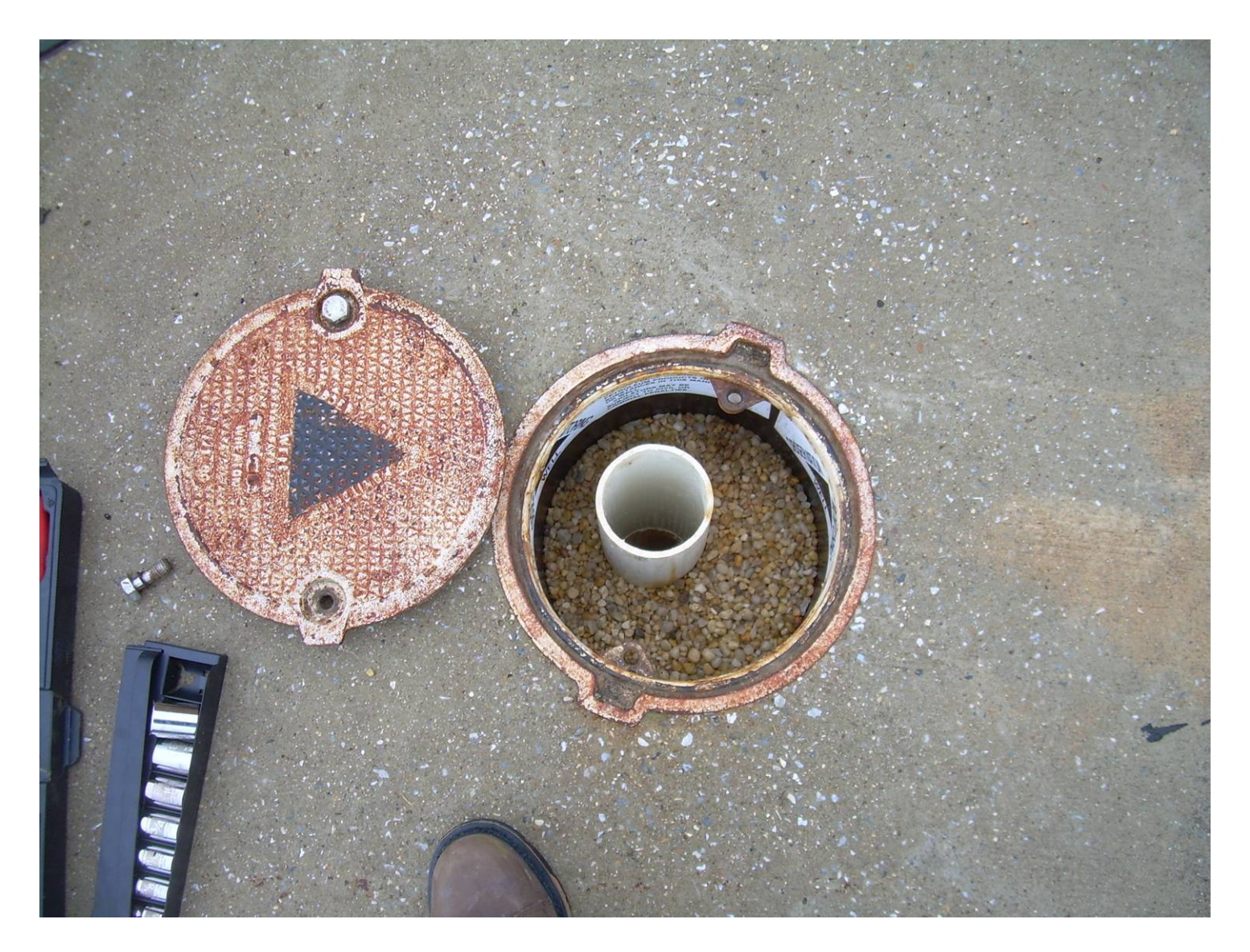
PERMANENT GROUNDWATER WELL INSTALLATION (FLUSH WITH SURFACE)