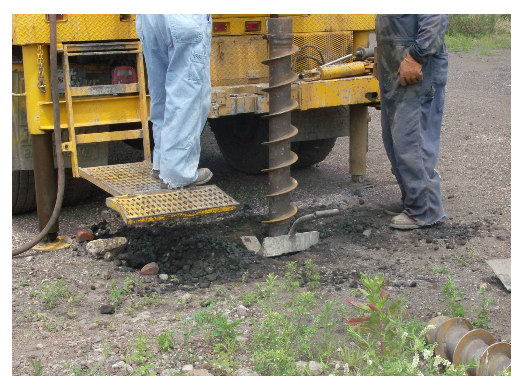
DRILLING RIG AUGER