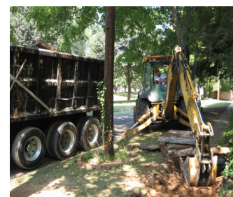
Defective concrete is removed