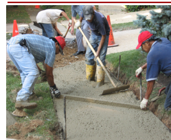
Concrete is smoothed and finished