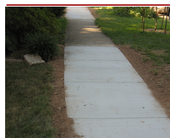
Completed sidewalk repair