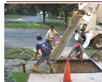
New concrete is poured into forms