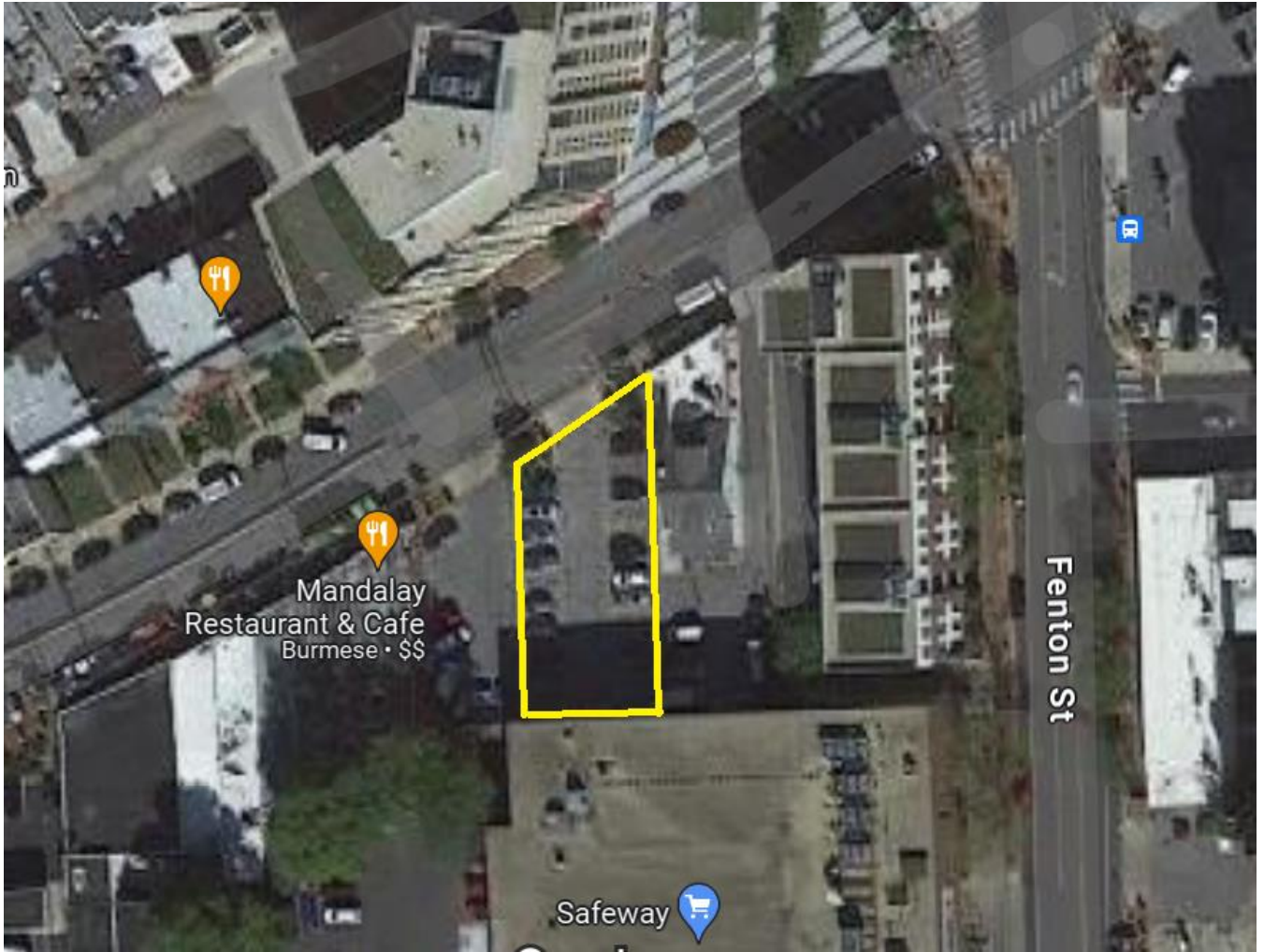
FIGURE 2: AERIAL OF SITE