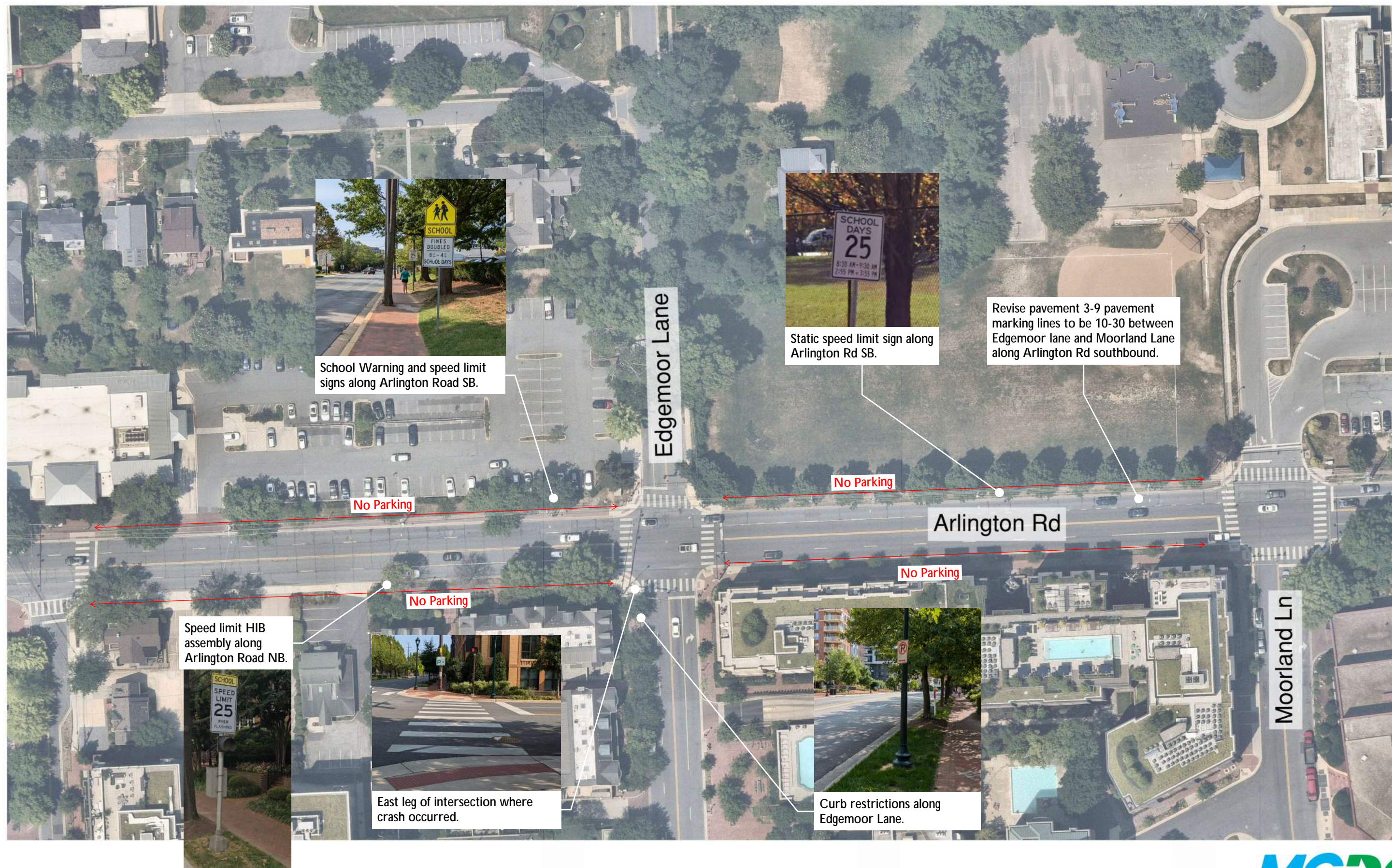
Figure 1 - Arlington Road Corridor Observations