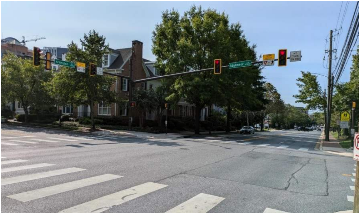
Photo 2. Southbound Arlington Road signal displays.