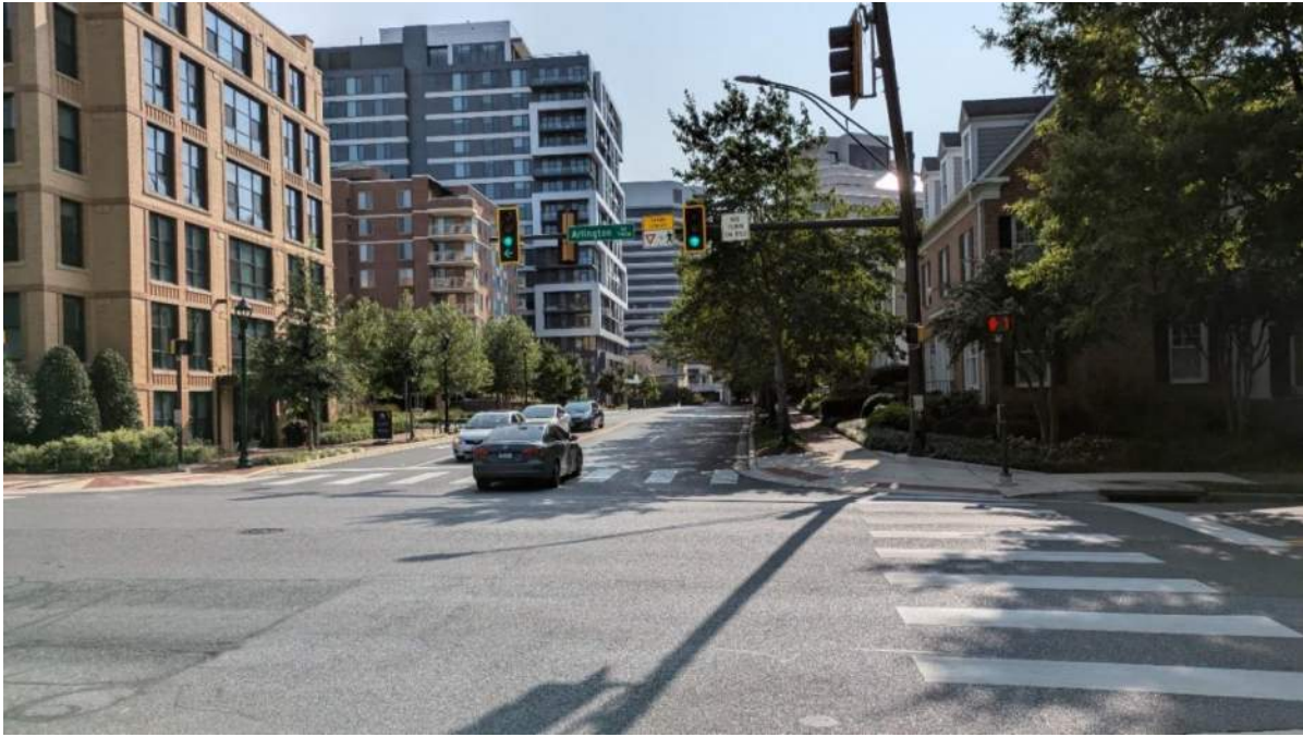
Photo 1. Looking towards east crossing leg of intersection at Edgemoor Lane where crash took place.