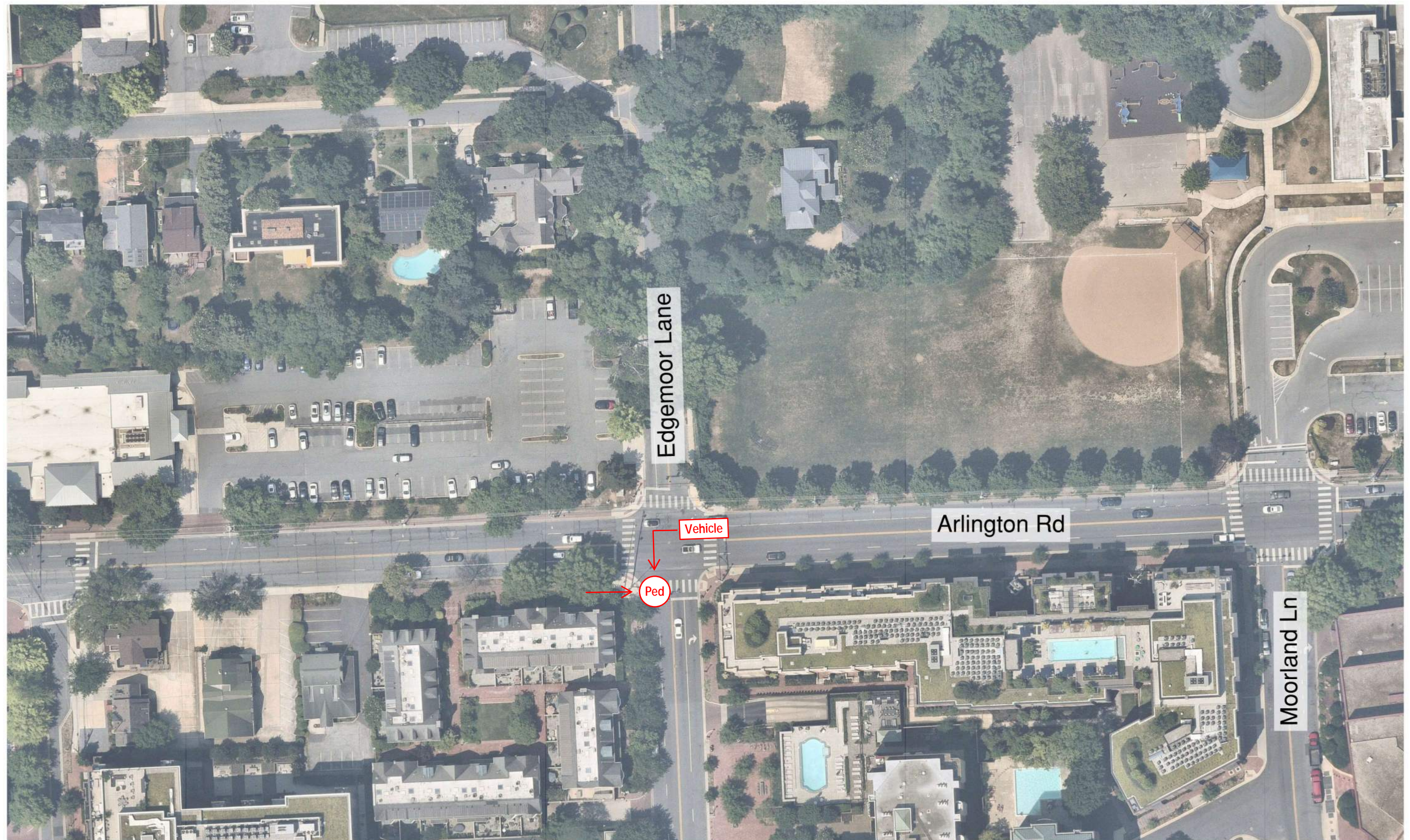
Figure 2 - Crash Diagram