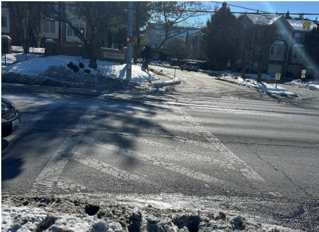
Photo 2. Taken from the northeast corner looking north. Approximate crash location.