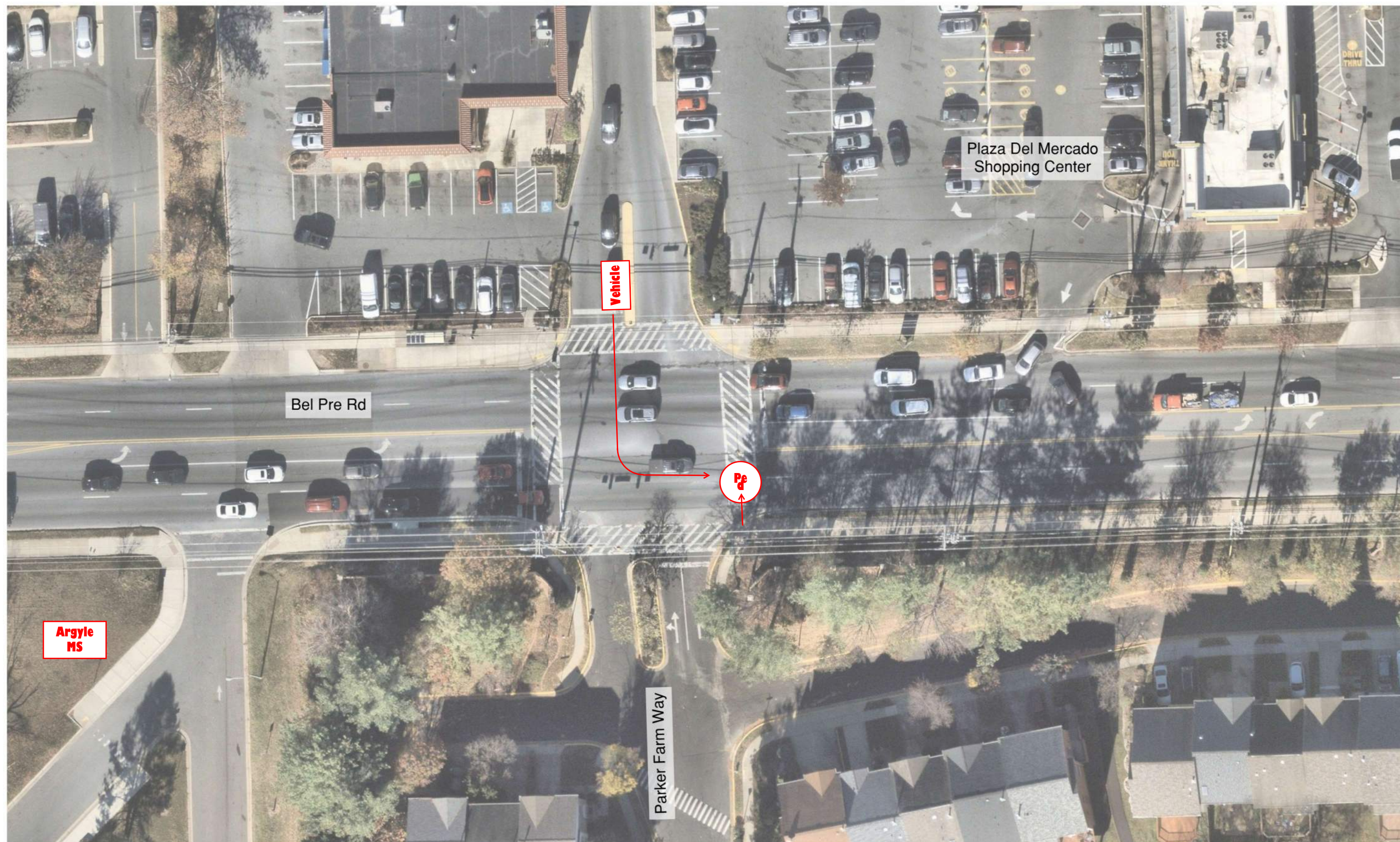
Figure 2 - Crash Diagram