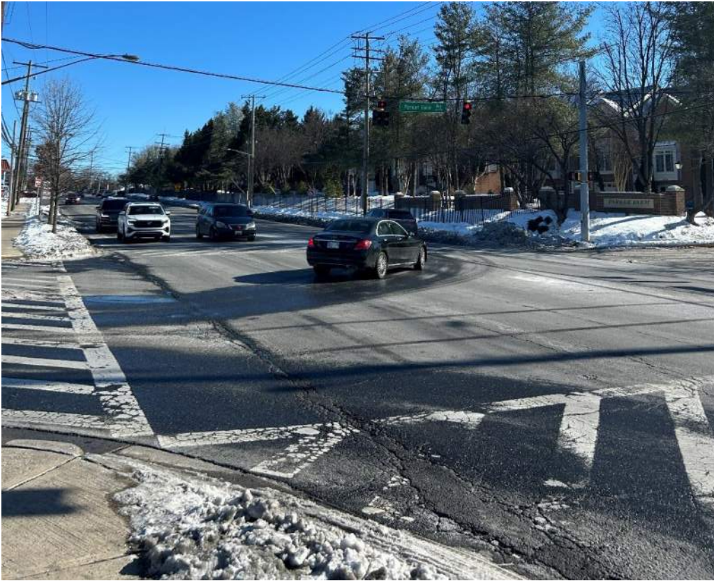
Photo 1. Taken from the northwest corner looking east along Bel Pre Road. Approximate crash location.