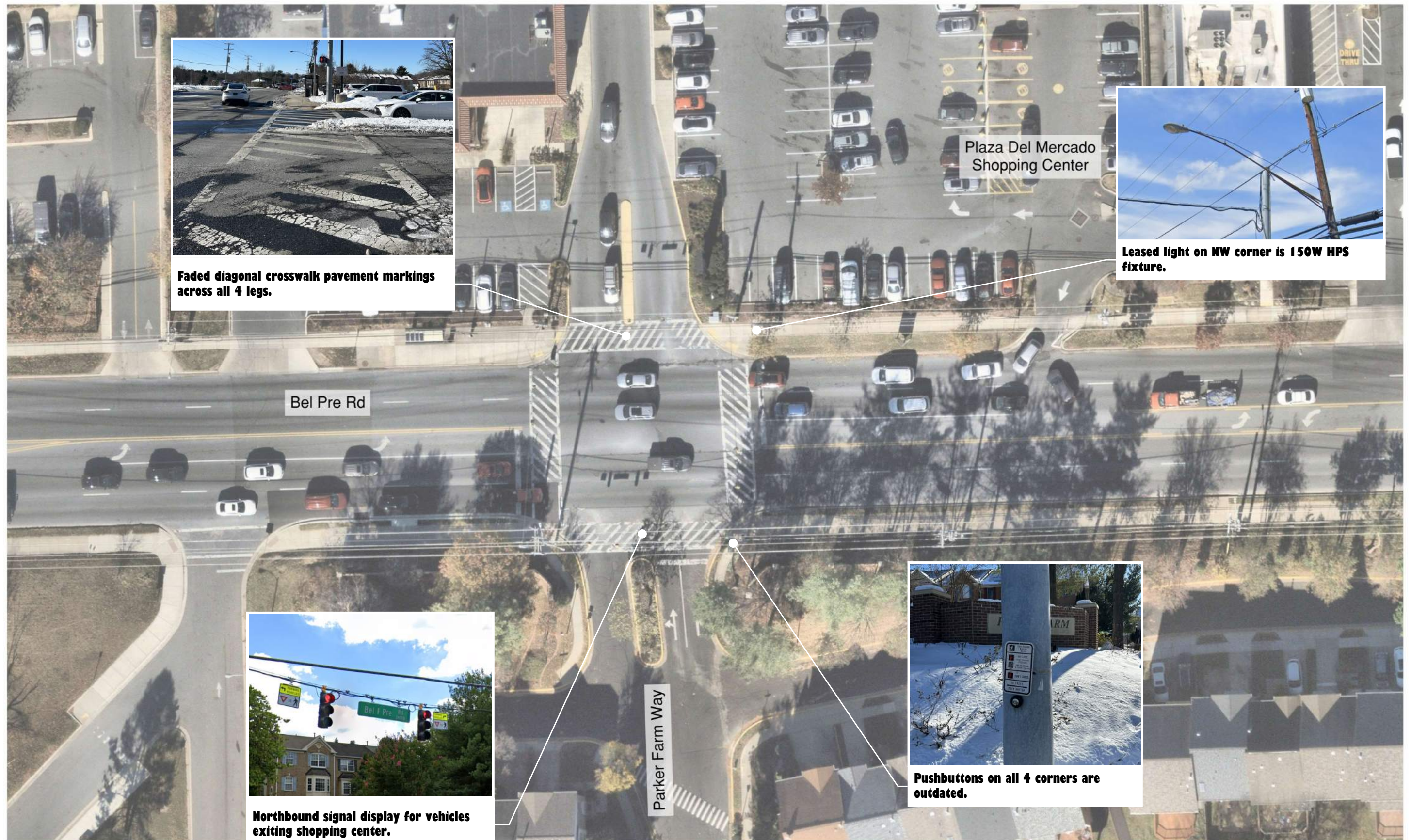
Figure 1 - Bel Pre Road Corridor Observations