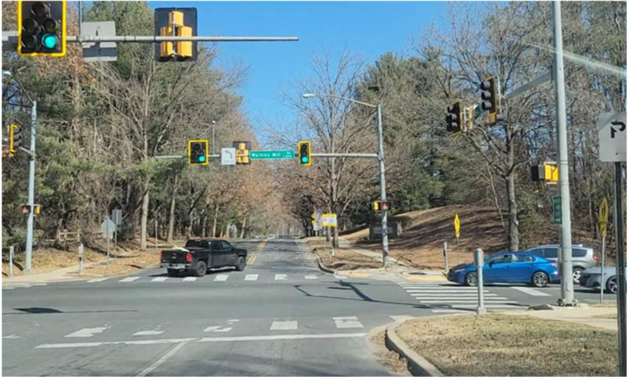
Photo 2. Taken along eastbound Apple Ridge Rd, looking east at Watkins Mill Rd. Southbound left-turning truck oversteers across the westbound approach. Faded west leg crosswalk and missing School Crossing signs on the right side of the roadway for both crosswalks over Apple Ridge Rd.