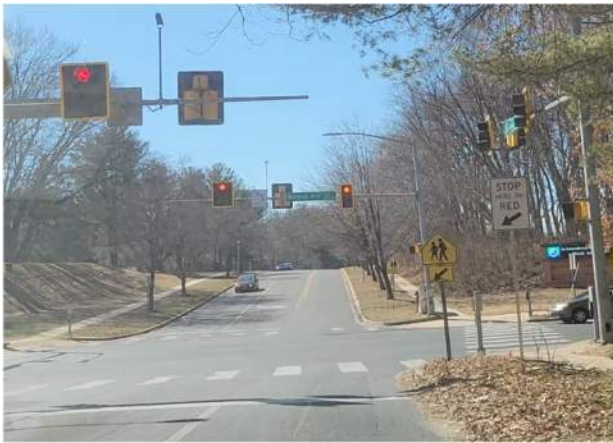
Looking westbound at Watkins Mill Rd. School Crossing signs and continental crosswalk markings.