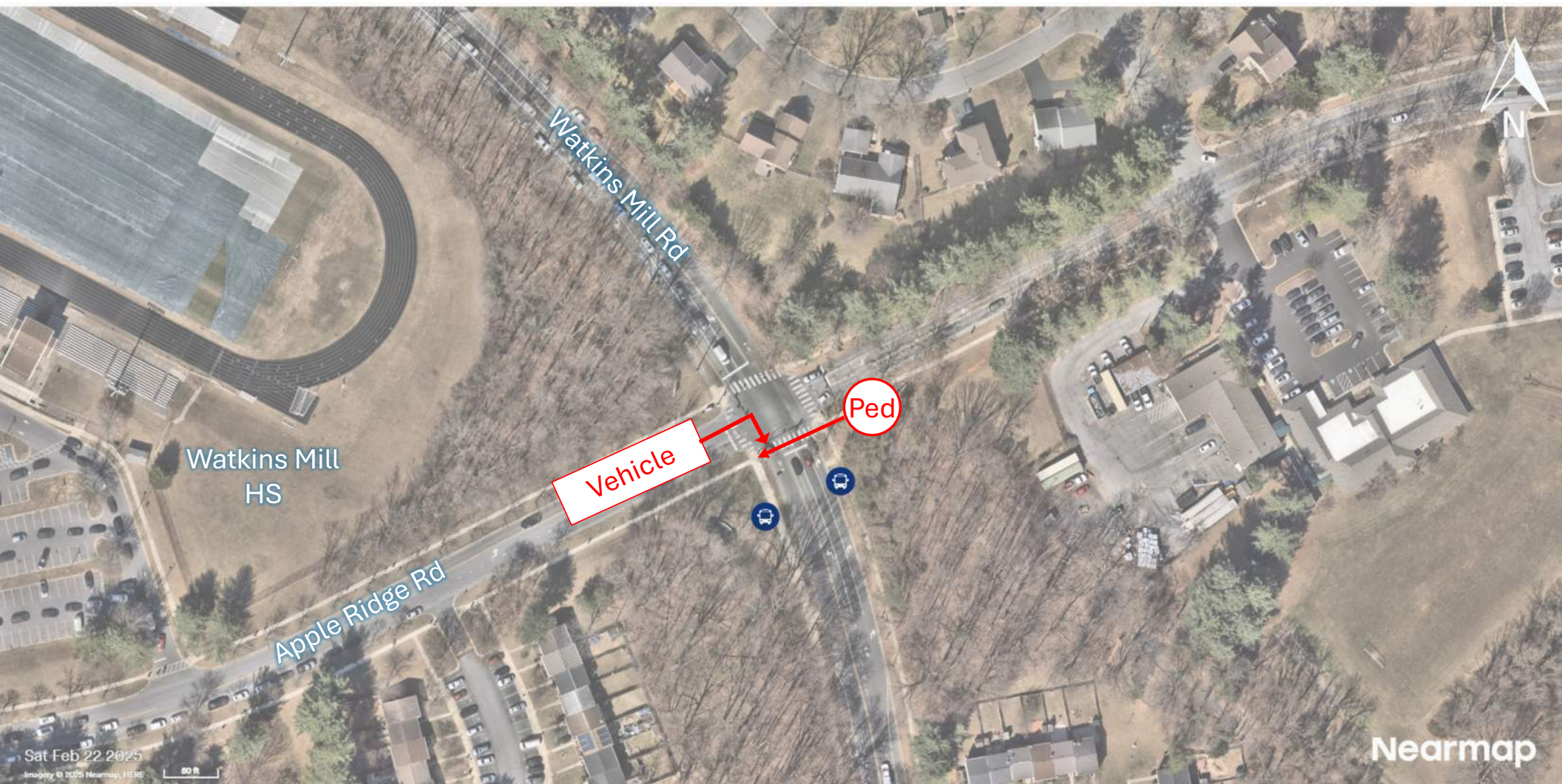
Figure 2 – Crash Diagram