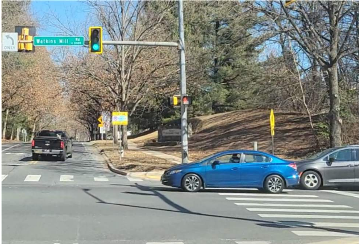
Photo 1. Taken along eastbound Apple Ridge Rd, looking east at Watkins Mill Rd. Northbound vehicle runs red light and stops past stop line within the crosswalk.