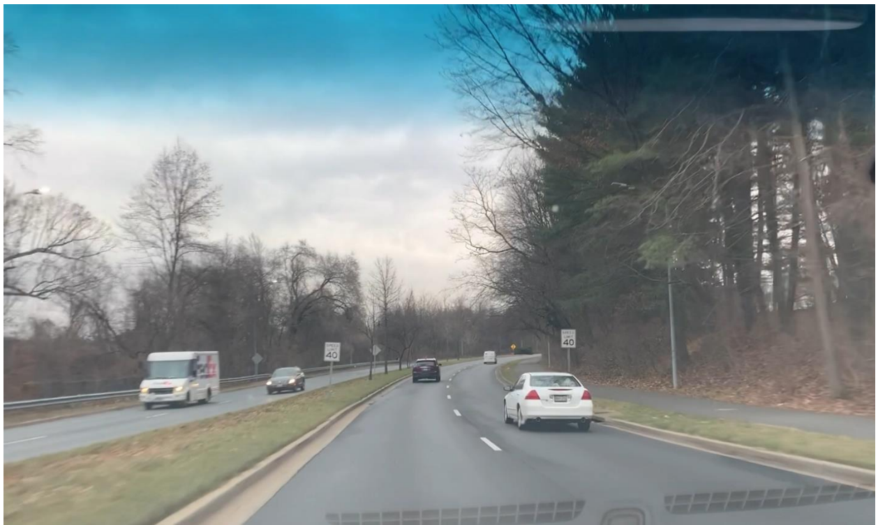
Eastbound West Gude Drive, approaching Watkins Pond Boulevard