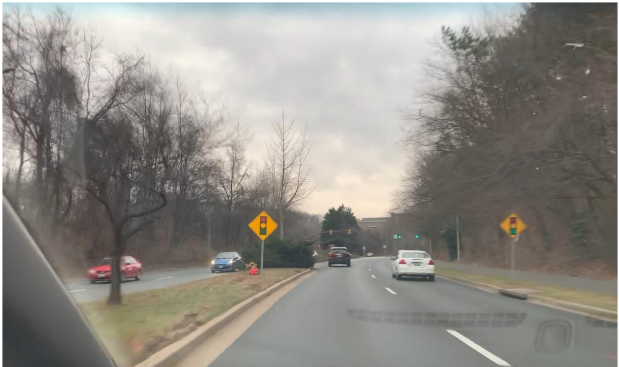
Eastbound West Gude Drive, approaching Watkins Pond Boulevard (crash location)