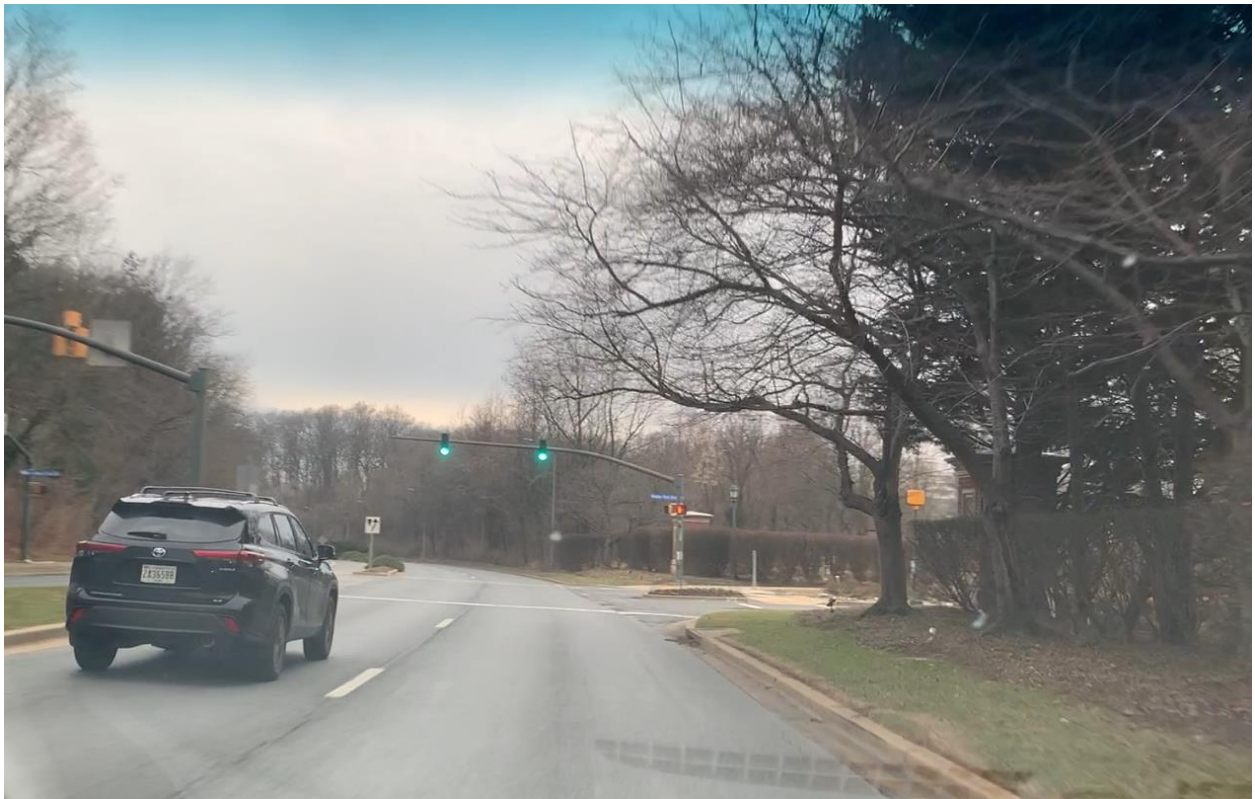
Westbound West Gude Drive, at Watkins Pond Boulevard