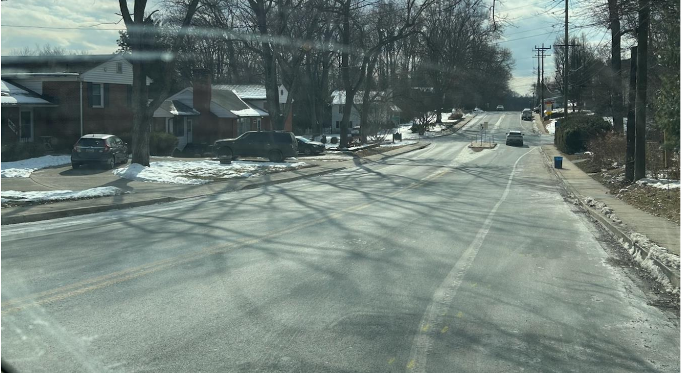
Southbound Cedar Lane, approaching crash location