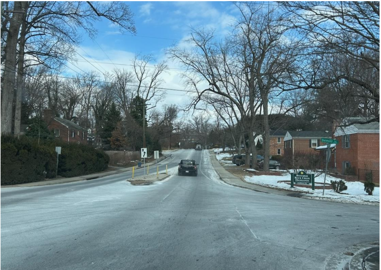
Northbound Cedar Lane, approaching crash location`