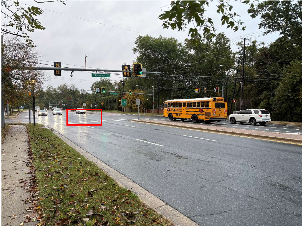
Montrose Road westbound receiving lane (Looking east) – Motorcycle traveling in middle through lane at intersection while vehicle executing eastbound left-turn from exclusive left-turn lane.