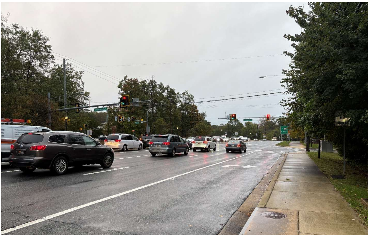
Montrose Road eastbound approach to Tildenwood Drive (Looking east) – Vehicle turning from eastbound left-turn lane at intersection.