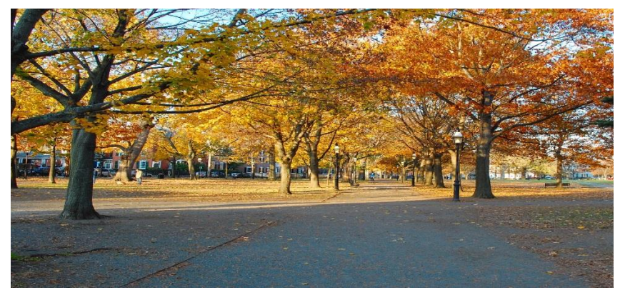
Fall is here...

Check us out on social media. Instagram and Twitter @777vote #mocovotes, #voterempowerment, #2018election & Facebook