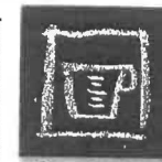
Illustration: Cathleen Casey