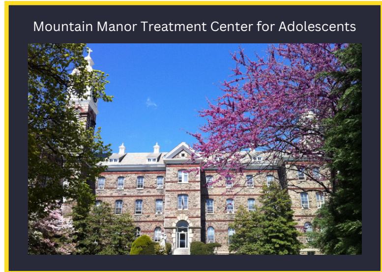
Mountain Manor Treatment Center for Adolescents

Our mission is to advocate in the County for accessible and comprehensive evidence-based prevention, intervention, and treatment services to promote recovery and reduce the biomedical, psychological, and social complications of alcohol and other drug use.