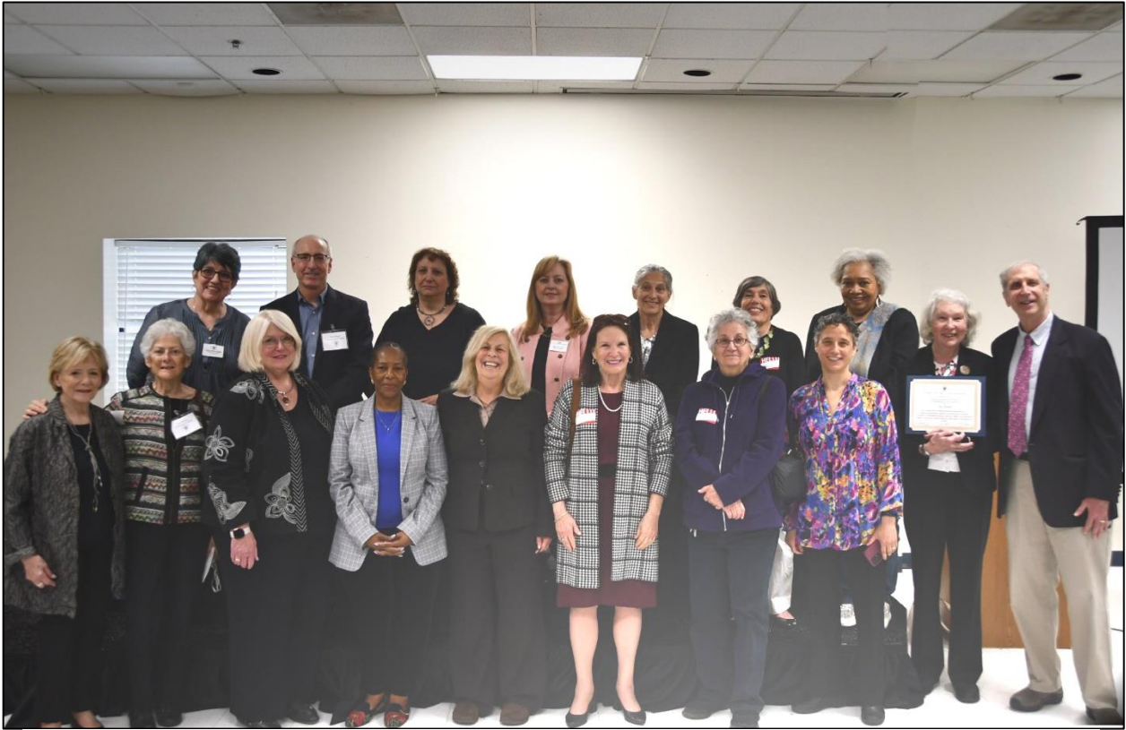
Commission on Aging, May 2023 Public Forum