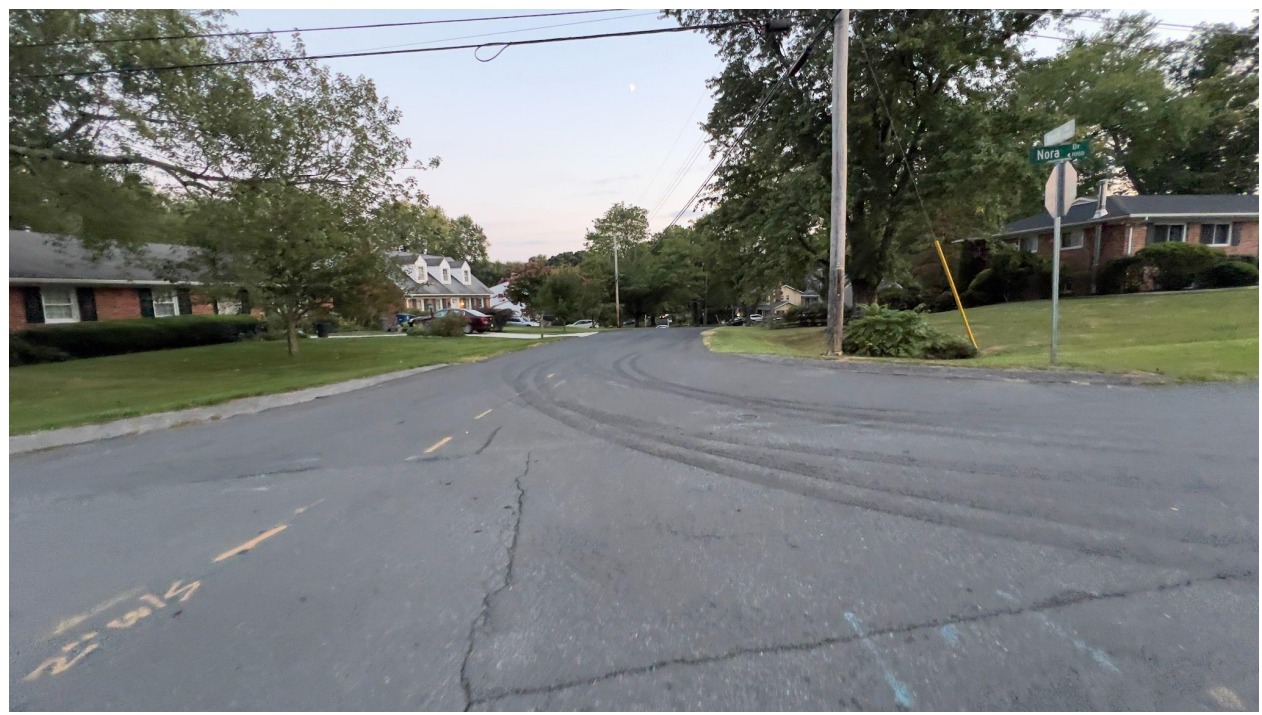
Photo taken 9/11/24 at 19:29 Intersection of Nora Drive with Renick Lane

Photo taken 9/11/24 at 19:29 of Renick Lane