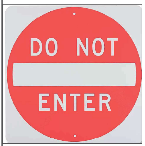
DO NOT ENTER SIGN