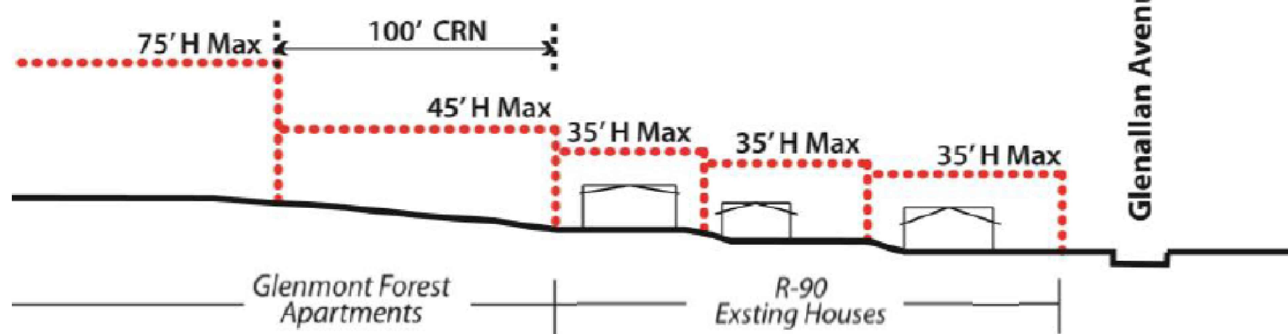
Transition Heights, Glenmont Forest Apartments.

Right of Way off-sets, by others, Subject to approval. Adjustments by applicant and/or County to implement Road Improvements at Site Plan.