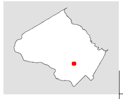
Exhibit 8 H-155