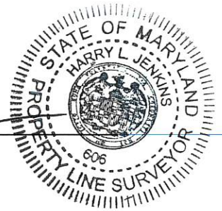
Exhibit 9 H-156