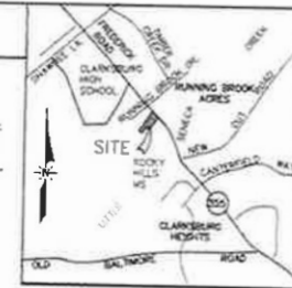
VICINITY MAP SCALE: 1" = 2000'