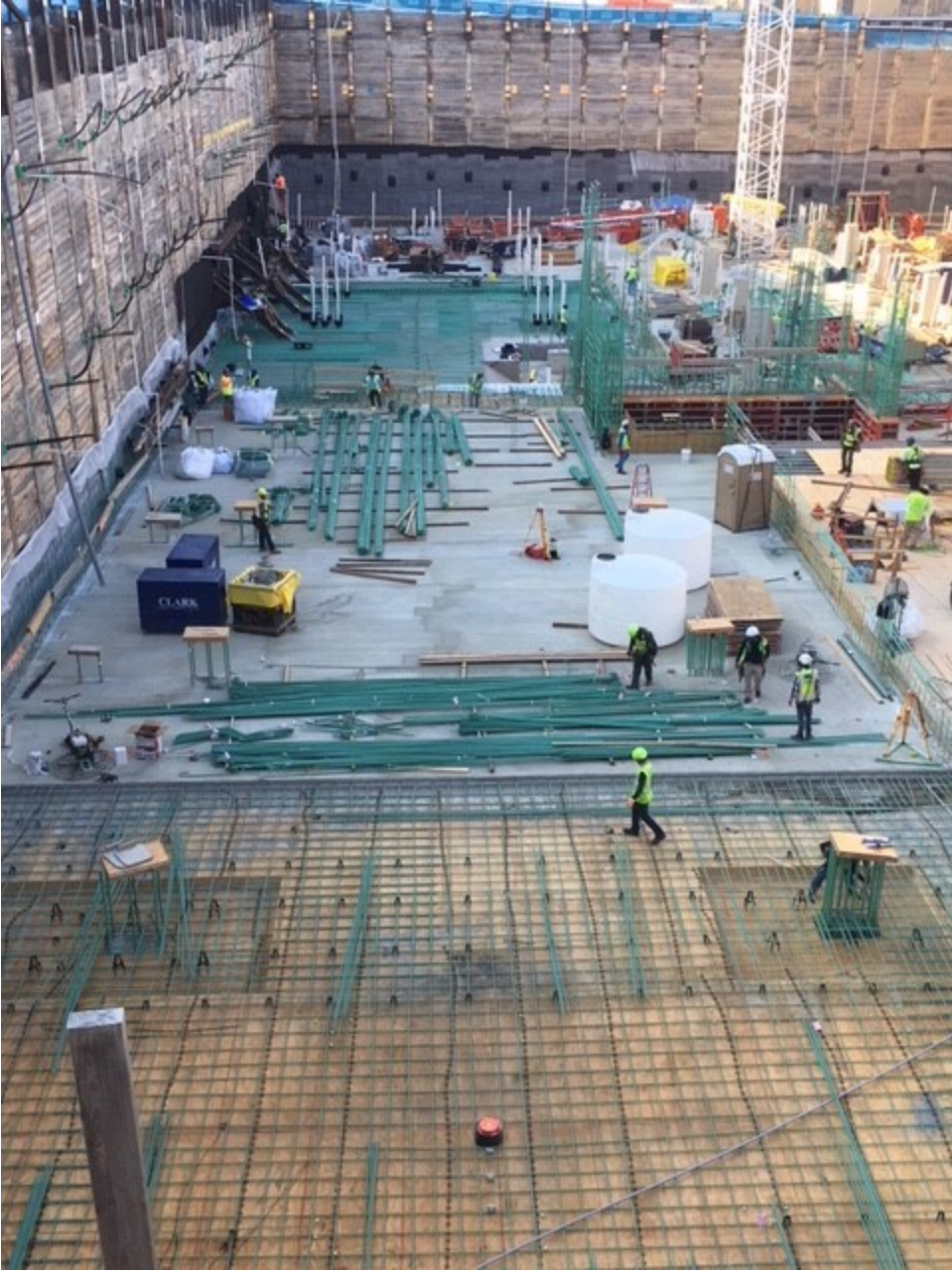
Level P3 under construction