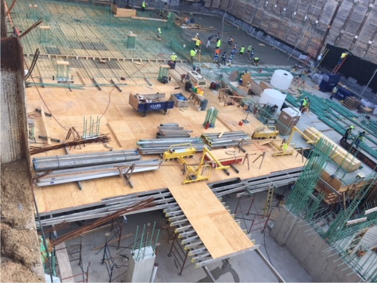
Level P4 Pour No. 10 (background)