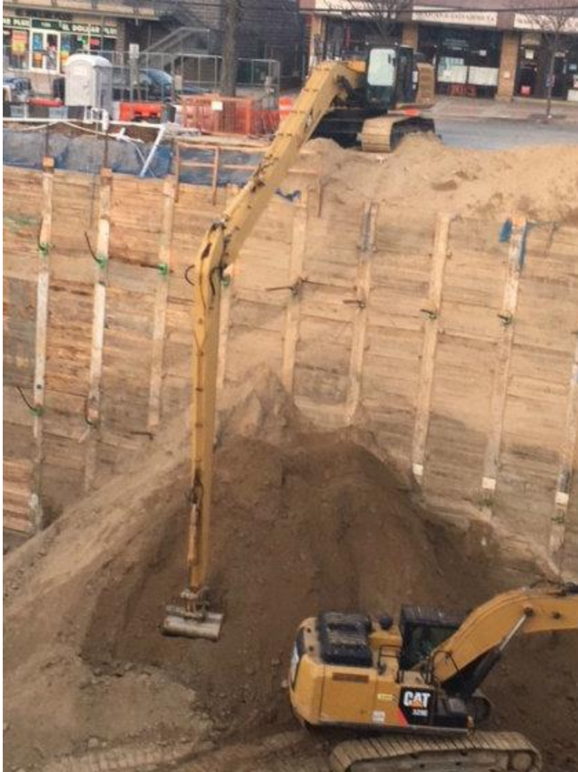
Last of the Foundation Excavation