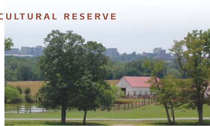
Poplar Spring Animal Sanctuary is a 427-acre farm near Poolesville that was permanently preserved under easement in 2008. It is situated along the Potomac River overlooking Loudon County, Virginia.

An agricultural land preservation easement is a voluntary agreement between a property owner and an agency or organization that places permanent restrictions on the land. The easement is recorded in the land records and becomes a permanent encumbrance on the property. Some easements are purchased from the landowner by an agency or organization, and some are donated by the landowner. The restrictions that are placed on the land are generally for the purpose of forever protecting the farmland for future food and fiber production. Most commonly, these restrictions limit or prevent future residential, commercial, and/or industrial development on the property. In addition to these restrictions, easements often require environmental stewardship, forest management planning, and/or other plans designed to protect the land.