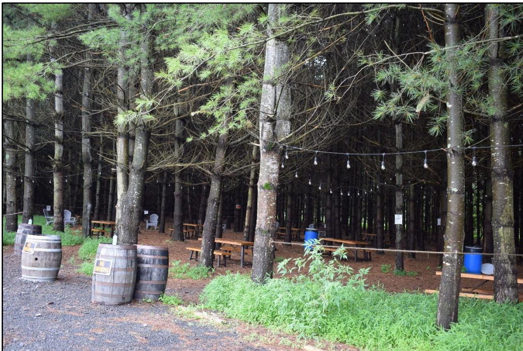
Elder Pine Brewing & Blending Co.

"The Office of Agriculture has been a wonderful resource that we truly appreciate."