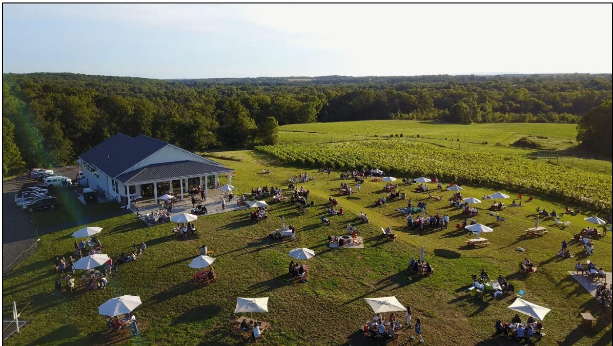
Windridge Vineyards - Photo by Isabelle Carbonell 2020