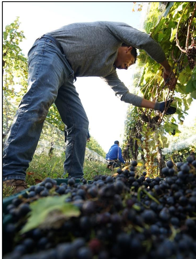
Windridge Vineyards - Photo by Isabelle Carbonell 2020

The report also addressed how to establish and clarify standards for allowing events at agritourism venues. Events are important components of many agritourism venues, bringing visitors to farms to participate in activities and purchase products. The ASAC provided recommendations for allowing events in the Ag Reserve and at agritourism venues, including Farm Alcohol Production facilities. Currently, the restriction on events is based on frequency rather than the scale or impacts of such events. Among other things, the committee discussed linking the size of the property to the size of the allowed event as is done for equestrian facilities and including standards for special events in the AR zone. Following up on this report will be important for making headway toward a more vibrant agritourism and farm alcohol production industry in Montgomery County.