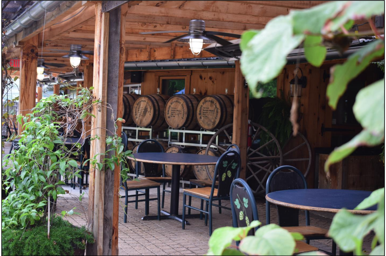
Brookeville Beer Farm

This is the first report to the County Council on the history, current status, and future trends of the Farm Alcohol Production Industry in Montgomery County since the passage of applicable zoning text amendments in 2018.