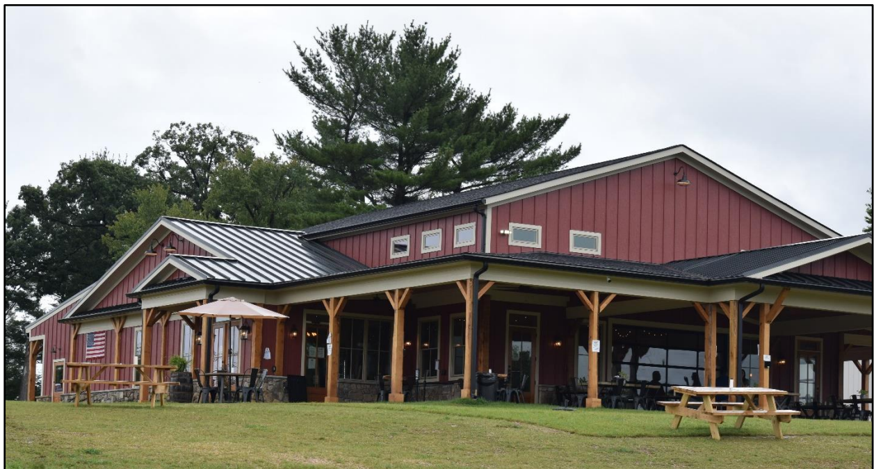
Lone Oak Farm Brewing Co.