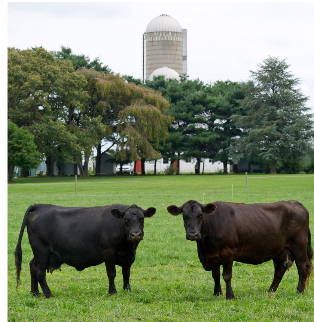
Beef farm in Kennedyville, Maryland.