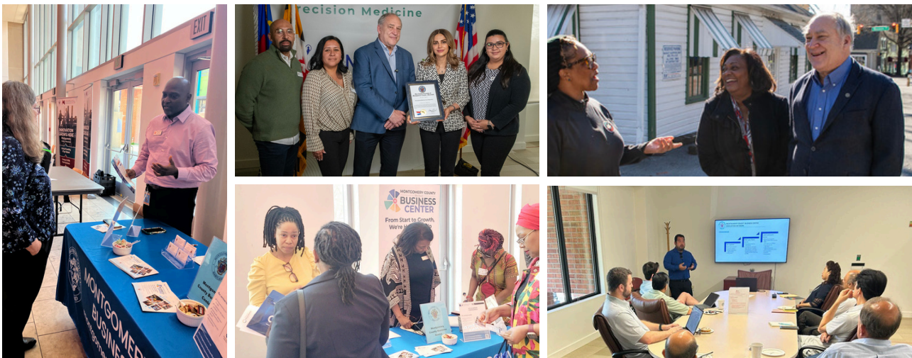
The Montgomery County Business Center team

Together, we are building a more connected, resilient, and equitable business ecosystem for Montgomery County.