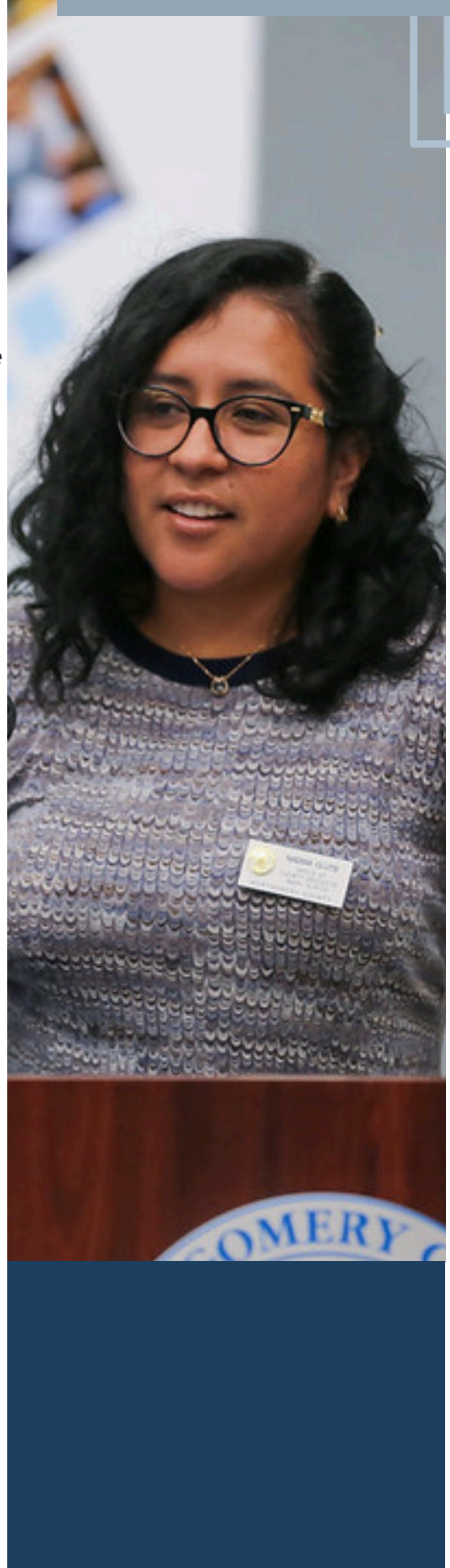
Business Center Manager