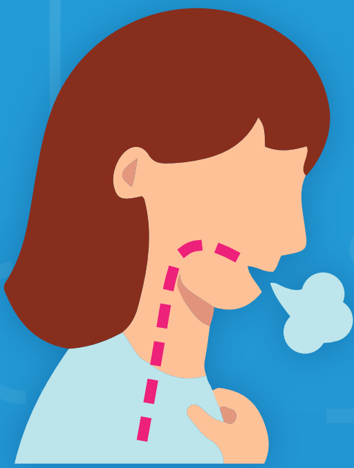
shortness of breath