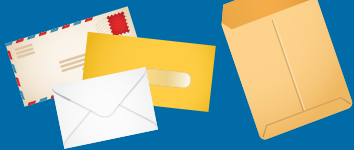
Unwanted mail & envelopes