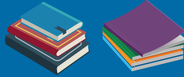
Hardback, paperback, & telephone books