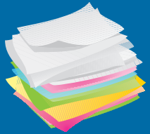
Clean, dry paper