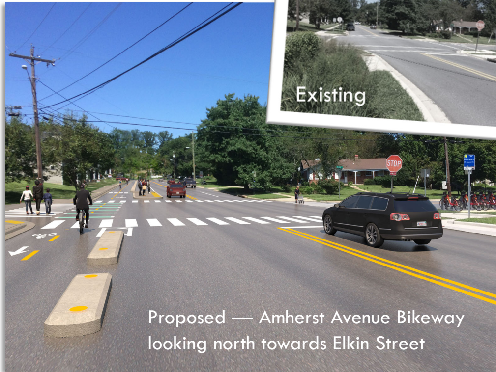
Proposed — Amherst Avenue Bikeway looking north towards Elkin Street