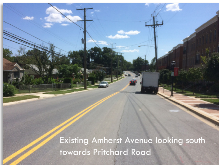
Existing Amherst Avenue looking south towards Prichard Road

Option 3 —Southbound travel lane only. Northbound traffic diverted. Parking lanes on both sides. Sidewalks on both sides. No widening.