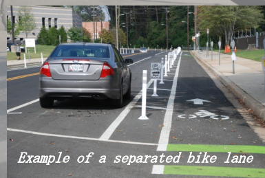
Example of a separated bike lane