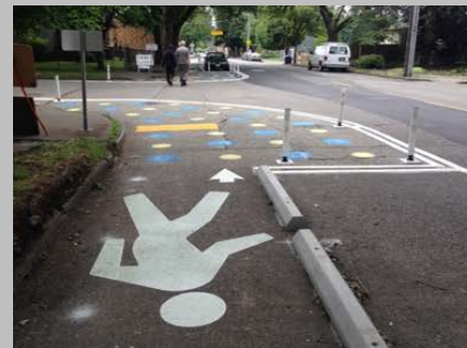
Top: speed hump. Second from top: bump-out Third from top: mini roundabout Bottom: walking lane

To sign up for the project update mailing list, please send an email to Matt.Johnson@MontgomeryCountyMD.gov and indicate you're interested in the Fenton Village projects mailing list.