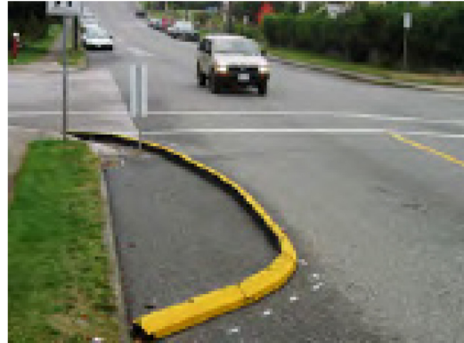
Row 1, left image: Speed hump. Right image: bump-out.