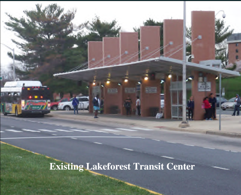
Existing Lakeforest Transit Center

Title VI: Montgomery County assures that no person shall, on the grounds of race, color, or national origin, as provided by Title VI of the Civil Rights Act of 1964 and the Civil Rights Act of 1987, be excluded from the participation in, be denied the benefits of, or be otherwise subjected to discrimination under any program or activity.