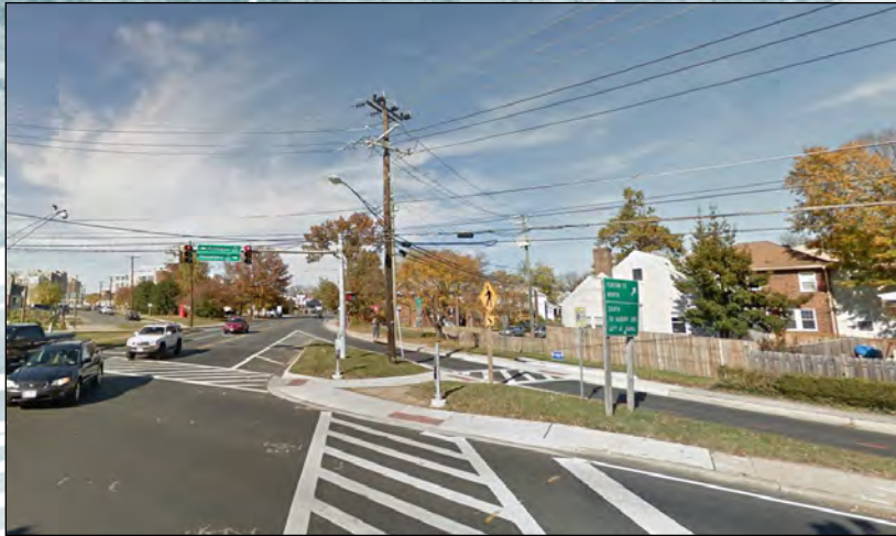
Top: Looking north on Fenton Street at MD 410. Right: Looking south on Fenton Street at Silver Spring Ave.

Public input is the key to an effective planning process as it allows MCDOT and Montgomery County decision makers to understand the needs of the community.